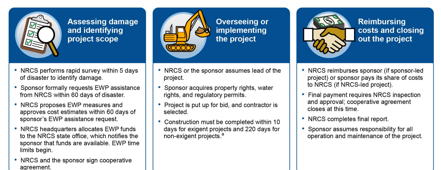
Figure 4: Process for Providing Assistance through the Natural Resources Conservation Service's (NRCS) Emergency Watershed Protection (EWP) Program

GAO-22-104326