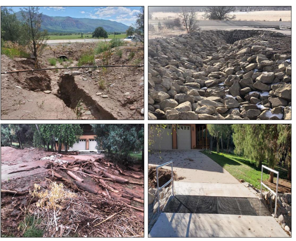
Figure 2: Post-Wildfire Flood Damage and Emergency Measures in Colorado

repair damaged dams; and plant vegetation to help slow or reduce erosion (see fig. 2 and 3).