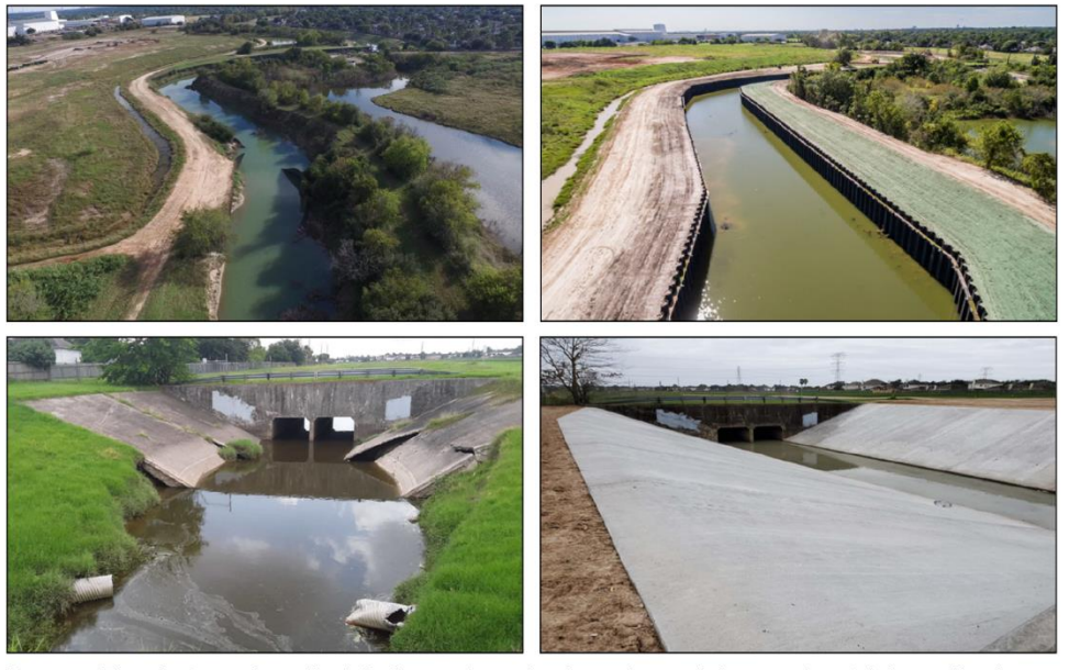
Top row: The photograph on the left shows streambank erosion and damage to retaining walls along a water channel; the photograph on the right shows repaired streambanks and new retaining walls built to withstand higher and faster-moving flows.

Bottom row: The photograph on the left shows damage to a water channel due to high water flows; the photograph on the right shows the implemented emergency measures, with full concrete slopes along the channel to reinforce it and minimize future damage.