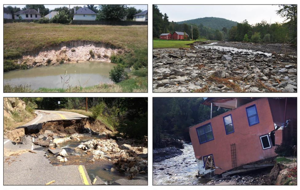
Clockwise from upper left: streambank erosion near homes in Texas, streambank erosion from flooding in New York, home damage from flooding in Colorado, and road failure from flooding in Colorado.

Sources: Harris County, Texas; Schoharie County, New York; Colorado Water Conservation Board. | GAO-22-104326 The number of natural disasters in the United States is rising, as extreme weather events become more frequent and intense, in part due to climate change. The U.S. Global Change Research Program reported in a November 2018 assessment that climate change is playing a role in the increasing frequency of some types of extreme weather that have led to billion-dollar disasters.<sup>11</sup> The effects of climate change include vulnerability to drought, lengthening wildfire seasons, and potential for extremely heavy rainfall becoming more common in some regions. For example, we previously reported that wildfire frequency and the duration of the wildfire season in the western United States have been increasing,