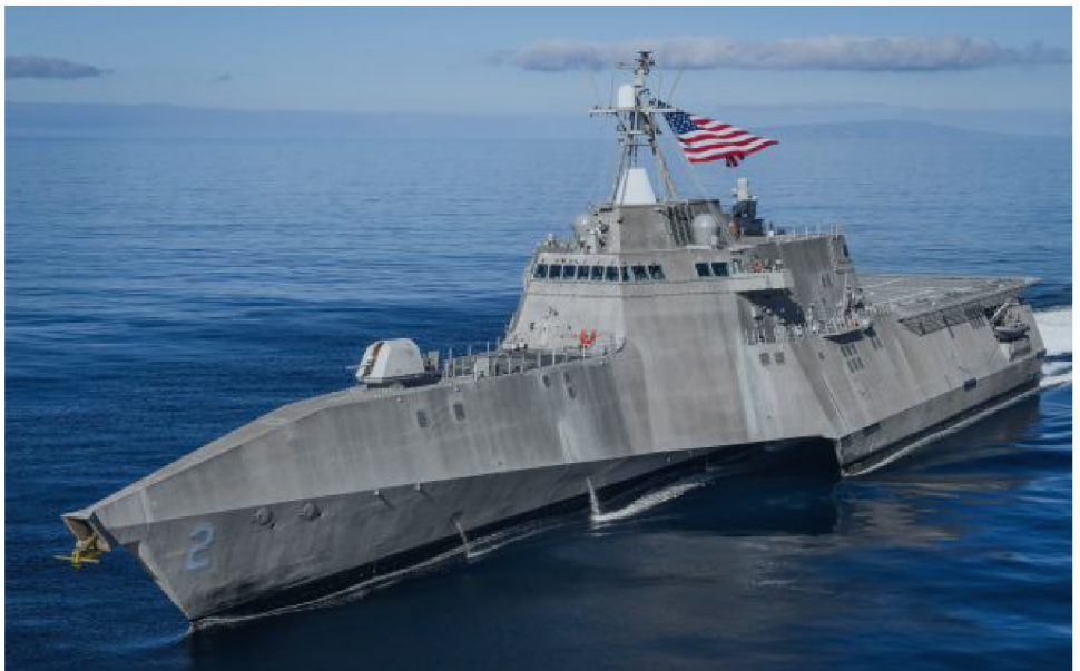
Figure 2: Littoral Combat Ship, Independence Variant

Source: U.S. Navy photo by Chief Mass Communication Specialist Shannon Renfro/Released. | GAO-21-172