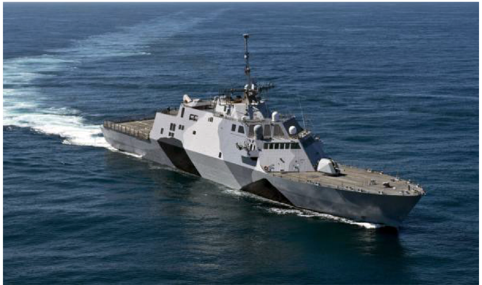
Figure 1: Littoral Combat Ship, Freedom Variant

GAO-21-172