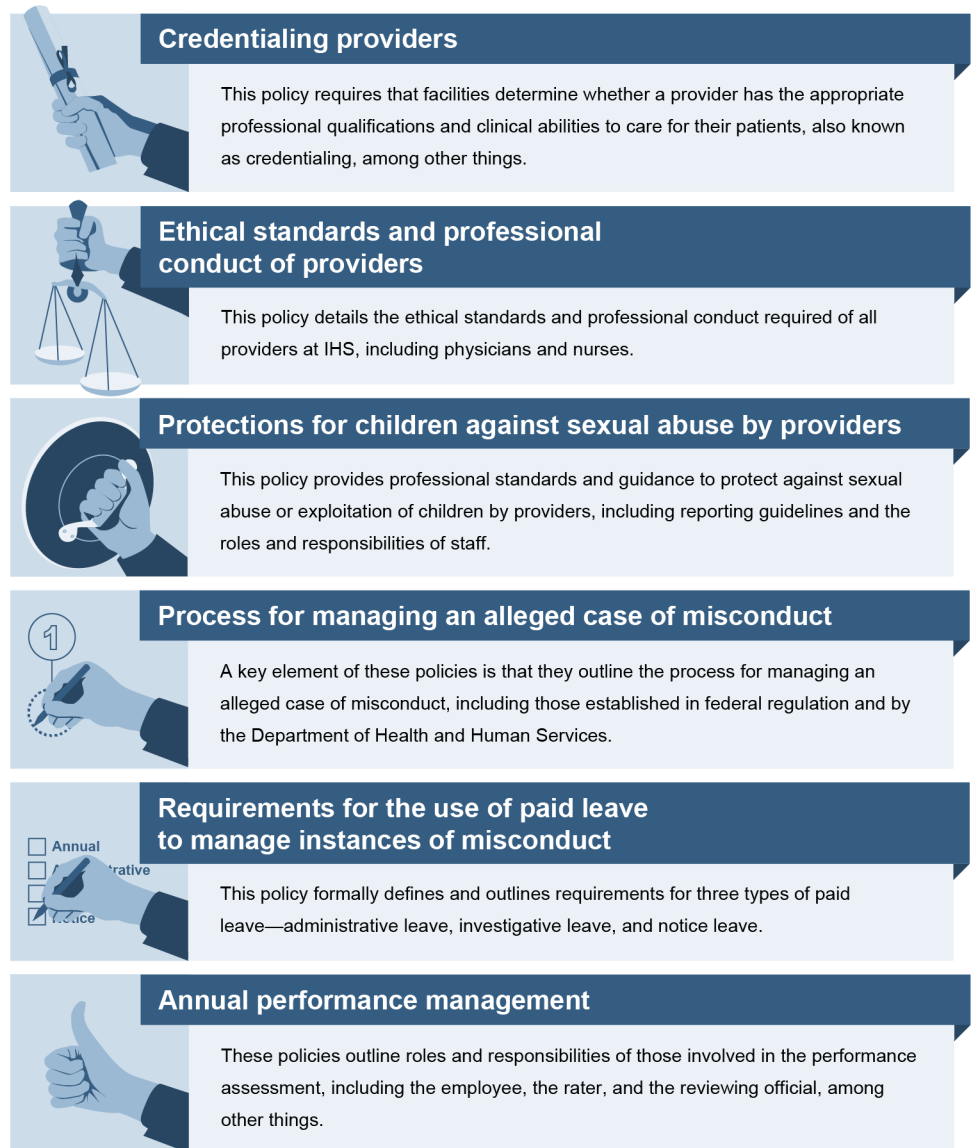
Figure 2: Indian Health Service (IHS) Policies Related to Overseeing Provider Misconduct and Substandard Performance