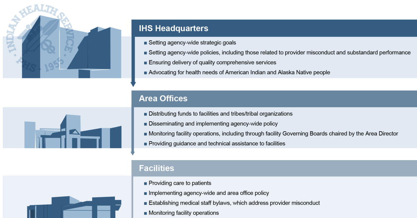
Figure 1: Health Care Responsibilities of Indian Health Service (IHS) Headquarters, Area Offices, and Federally Operated Facilities