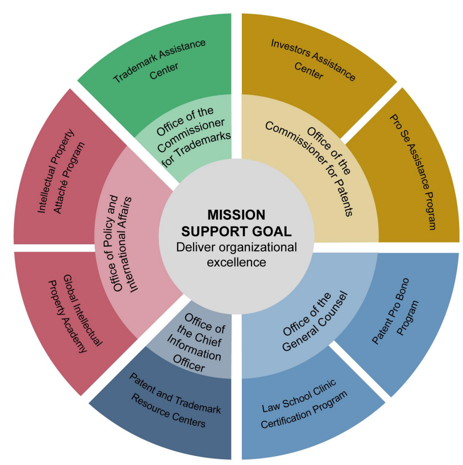
Figure 2: U.S. Patent and Trademark Office (USPTO) Programs That Focus on Small Businesses and Inventors Support the Agency's Goal of Delivering Organizational Excellence