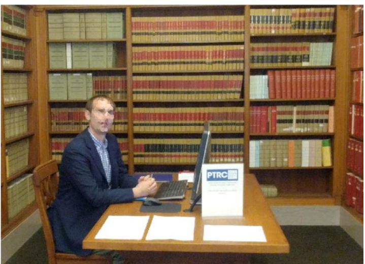
Source: USPTO (top left) and GAO (top right, bottom left, and bottom right). | GAO-20-556