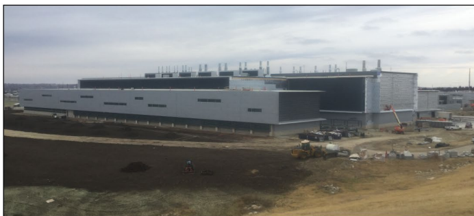
Figure 1: Construction Site of the National Bio and Agro-Defense Facility (NBAF) as of November 2019 and an Artist's Rendering of NBAF When Complete

The main laboratory building at NBAF is designed to provide 574,000 square feet of space for research and diagnostic laboratories, training facilities, and animal and support spaces. According to USDA officials, the annual cost for operations and maintenance of the facility and the science program there is estimated to be about $200 million once the facility is operational. 23 Figure 1 shows the construction site of NBAF and what the completed facility is to look like.