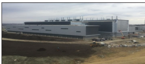
Construction Site of the National Bio and Agro-Defense Facility (NBAF) as of November 2019 and an Artist's Rendering of NBAF When Complete

However, critical steps remain to implement the transfer of ownership of NBAF to USDA and prepare for the facility's operation, and some efforts have been delayed. Critical steps include obtaining approvals to work with high-consequence pathogens such as foot-and-mouth disease, and physically transferring pathogens to the facility. DHS estimates that construction of NBAF has been delayed by at least 2.5 months because of the effects of the COVID-19 pandemic. USDA officials stated that, until the full effects of delays to construction are known, USDA cannot fully assess the effects on its efforts to prepare for the facility's operation. In addition, USDA's planning efforts were delayed before the pandemic for the Biologics Development Module—a laboratory at NBAF intended to enhance and expedite the transition of vaccines and other countermeasures from research to commercial viability. A November 2018 schedule called for USDA to develop the business model and operating plan for the module in 2019. Officials stated in May 2020 that USDA intends to develop the business model and operating plan by fiscal year 2020's end.