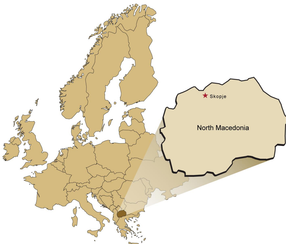
Figure 1: North Macedonia's Location in Europe

Source: GAO Map Resources (map). | GAO-20-158