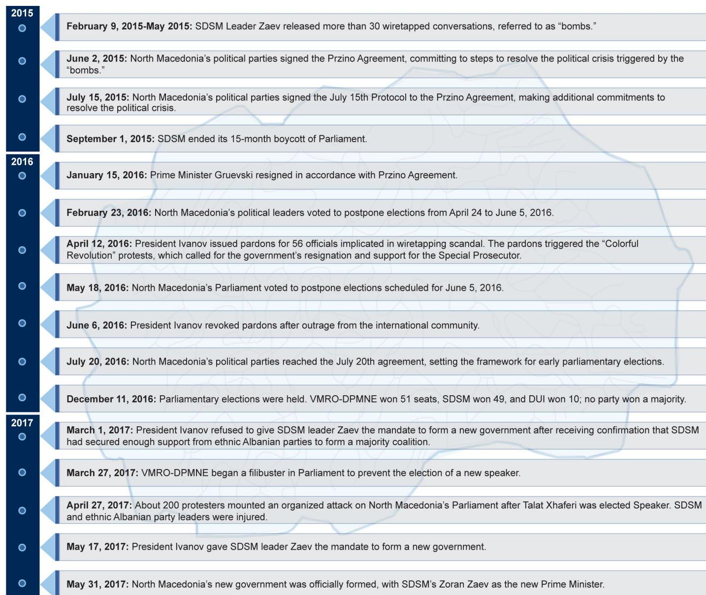
Figure 2: Timeline of Political Events in North Macedonia, 2015-2017

Legend : DUI = Democratic Union for Integration; SDSM = Social Democratic Union of Macedonia; VMRO-DPMNE = Internal Macedonian Revolutionary Organization–Democratic Party for Macedonian National Unity.