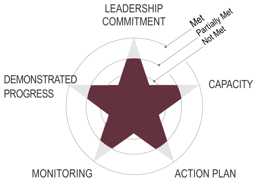
Figure 2: Improving Federal Management of Programs That Serve Tribes and Their Members

As we reported in the March 2019 high-risk report, when we applied the five criteria for High-Risk List removal to each of the three segments—education, energy, and health care—we determined that Indian Affairs, BIE, BIA, and IHS have each demonstrated some progress. Overall, the agencies have partially met the leadership commitment, capacity, action plan, monitoring, and demonstrated progress criteria for the education, health care, and energy areas. However, the agencies continue to face challenges, particularly in retaining permanent leadership and a sufficient workforce.