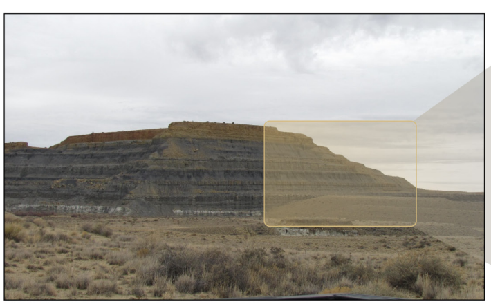
Figure 5: Erosion of Remediated Mountainsides at the Jackpile-Paguate Uranium Mine

According to information provided by EPA, the Jackpile-Paguate Uranium mine is a 2,656-acre site located on the Pueblo of Laguna, New Mexico, about 40 miles west of Albuquerque. Anaconda Copper Mining and The Anaconda Company, predecessors to the Atlantic Richfield Company, moved more than 400 million tons of rock within the mine between 1952 and 1982 area in addition to 25 million tons of uranium ore off-site for additional processing. Mining operations contaminated surface water with hazardous substances. Additionally, according to a report by the U.S. Department of Health and Human Services, people living in villages near the site could be exposed to contamination through radioactive materials from the site being used in home construction, or through contact with mine contaminants suspended in air or present in dust blown or tracked from the mine. Reclamation of the mine began in 1990 and was closed out in June 1995; however, EPA was not involved in the initial reclamation prior to the site being listed on the NPL. Figure 5 is a photograph of Gavalon Mesa, one of the major mining areas at the site, and erosion typical to a previously reclaimed area.