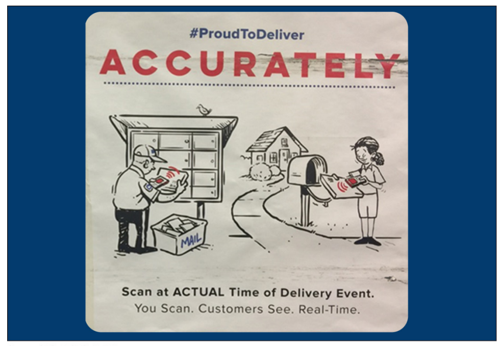
Figure 5: Photo of a Job Aid Poster Showing Correct Scanning Procedures as Posted in a Post Office