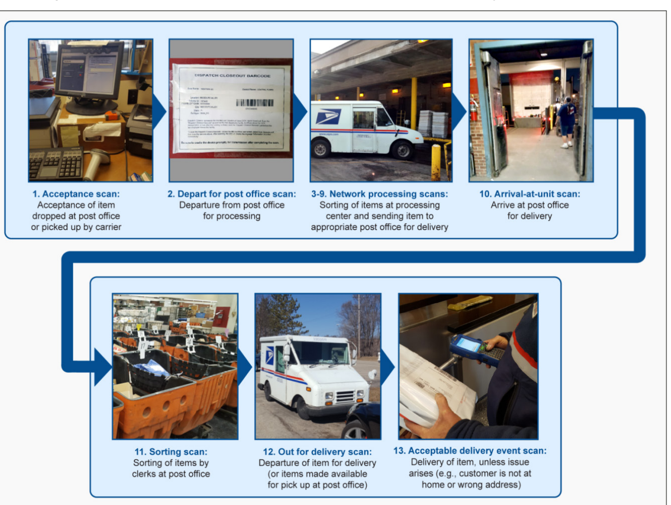
Figure 3: Scanning Points That Track USPS's Competitive Products from Acceptance to Delivery

Source: GAO analysis of United States Postal Service Information. | GAO-18-638