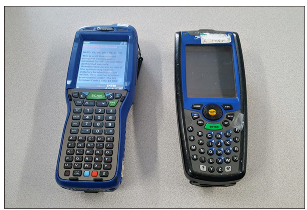
Figure 4: Devices Used by U.S. Postal Service to Scan Barcodes—Mobile Delivery Device (left) and Intelligent Mail Device (right)

other facilities use similar scanning devices without GPS technology, such as the handheld Intelligent Mail Device (IMD) to perform the manual scans (see fig. 4).<sup>13</sup>