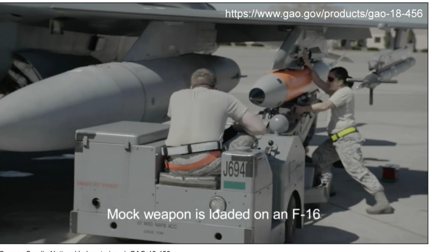
GAO-18-456 To view a video of a B61-12 flight test, see http://www.gao.gov/products/gao-18-456