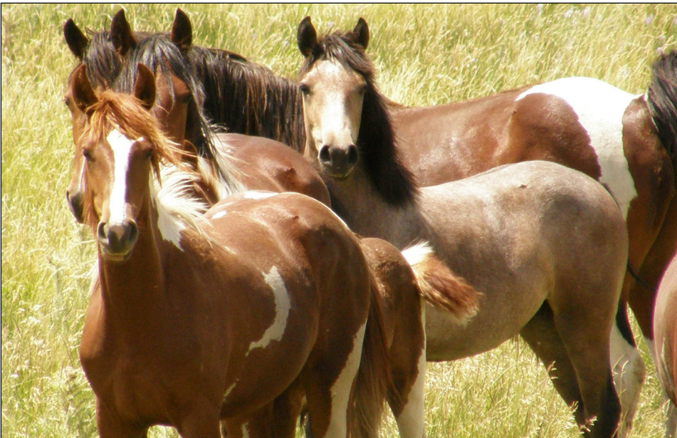
Figure 1: Wild Horses on Public Lands

Source: Bureau of Land Management. | GAO-17-680R