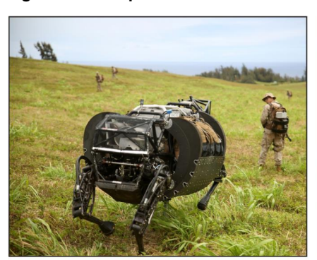
Figure 4: Examples of Manned and Unmanned Load Transferring Systems