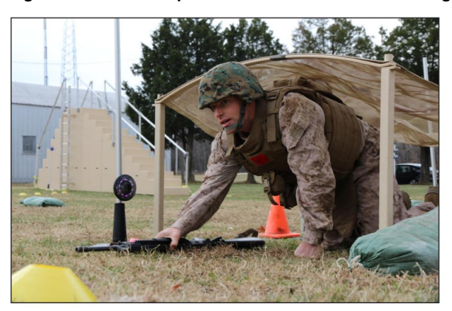
Figure 3: Marine Corps Load Effects Assessment Program Course