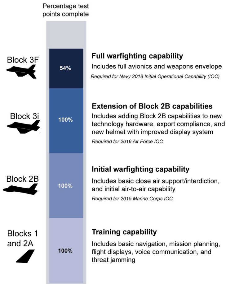
Figure 3: Development and Flight Test Status of F-35 Joint Strike Fighter Mission Systems Software Blocks as of December 2016