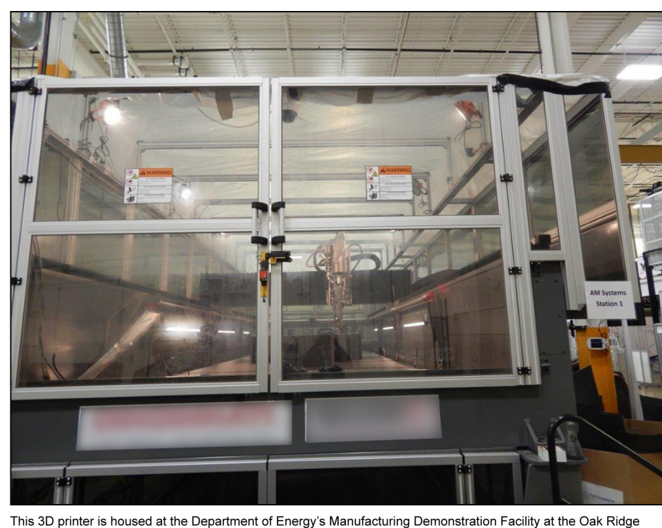
Figure 3: 3D Printer Used in Advanced Manufacturing

This 3D printer is housed at the Department of Energy's Manufacturing Demonstration Facility at the Oak Ridge National Laboratory, which partners with the Manufacturing USA Advanced Composites Manufacturing Innovation institute in Knoxville, TN.