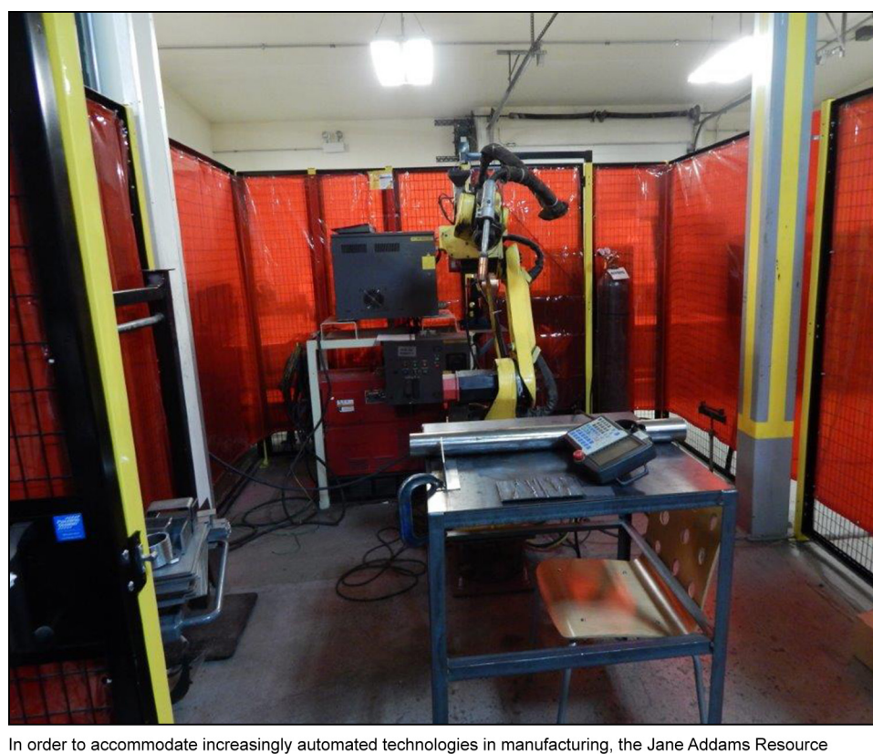
Figure 4: Welding Machine Used For Training

In order to accommodate increasingly automated technologies in manufacturing, the Jane Addams Resource Corporation acquired this robotic welder, which can be programmed to handle parts and weld. This welding machine is used to teach welding techniques to students in JARC's training program.