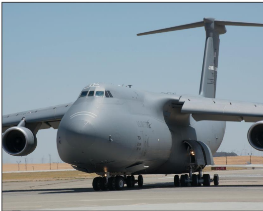
C-5 Super Galaxy