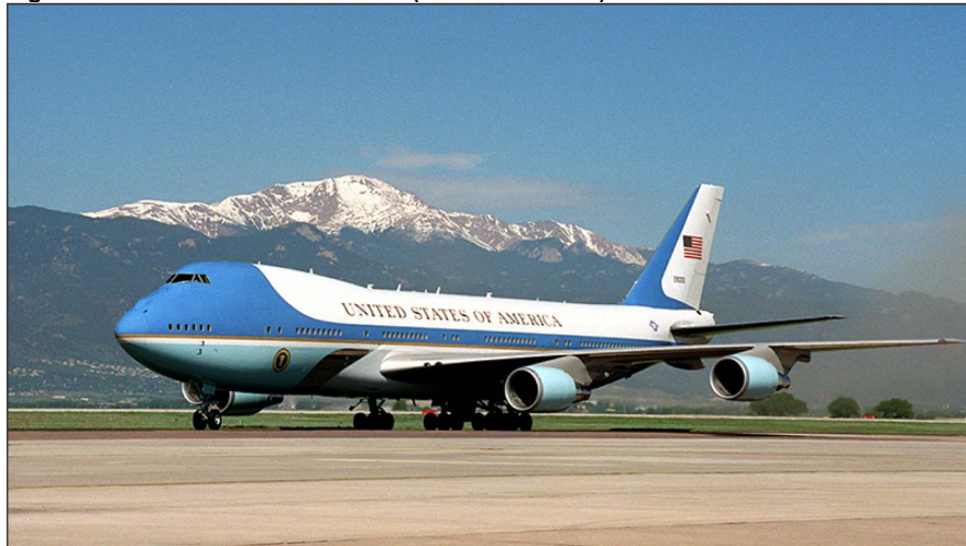
Figure 1: The U.S. Air Force VC-25A ("Air Force One")

a Other related expenses includes commercial airfares.