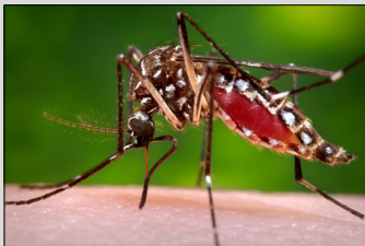
James Gathany (photograph) Source: GAO analysis;| GAO-16-547T

Diagnosing Zika virus infection is complicated because it is difficult to differentiate it from other similar diseases, such as dengue or yellow fever, and some tests for Zika virus antibodies suffer from cross-reactivity with antibodies to similar viruses. For example, a person previously infected with another flavivirus such as dengue could be falsely identified as also having been exposed to the Zika virus (and vice-versa).