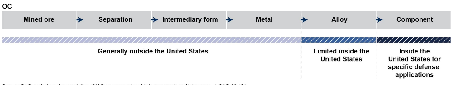
Figure 2: Generalized Rare Earth Materials Supply Chain for Metal Components

Source: GAO analysis and presentation of U.S. government and industry reports and interviews. \mid GAO-16-161