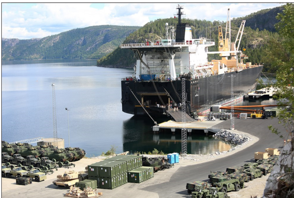
Figure 3: Equipment Offloading USNS Williams at Pier in Hammernesodden, Norway, 2014

GAO-15-651