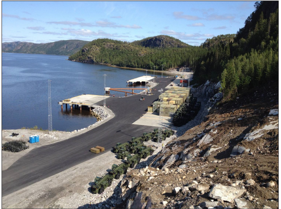
Figure 2: Norwegian Constructed Pier in Hammernesodden, Norway, 2014

GAO-15-651