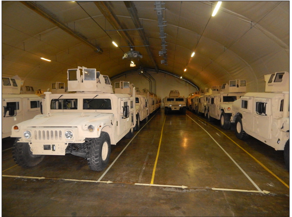
Figure 4: HMMWVs at Frigard Cave, Norway, 2014