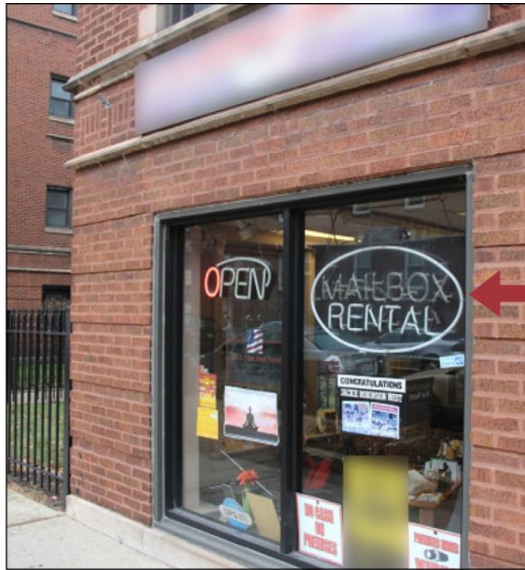
Figure 2: Mailbox Rental Store with a Suite Number Address Used as a Provider Practice Location

Provider listed this mailbox-rental store as its practice location