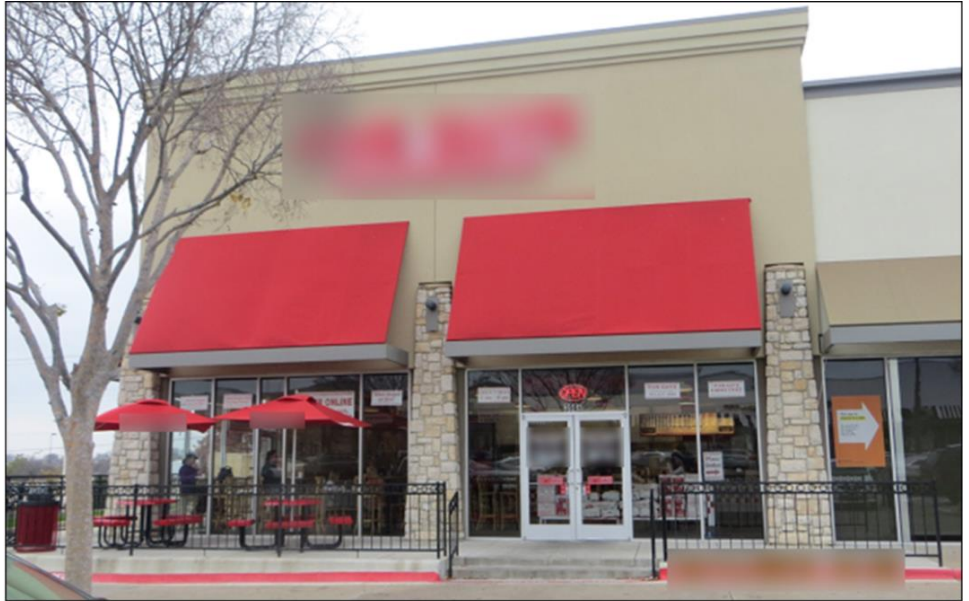
Figure 3: Fast-Food Franchise Listed as Provider's Practice Location