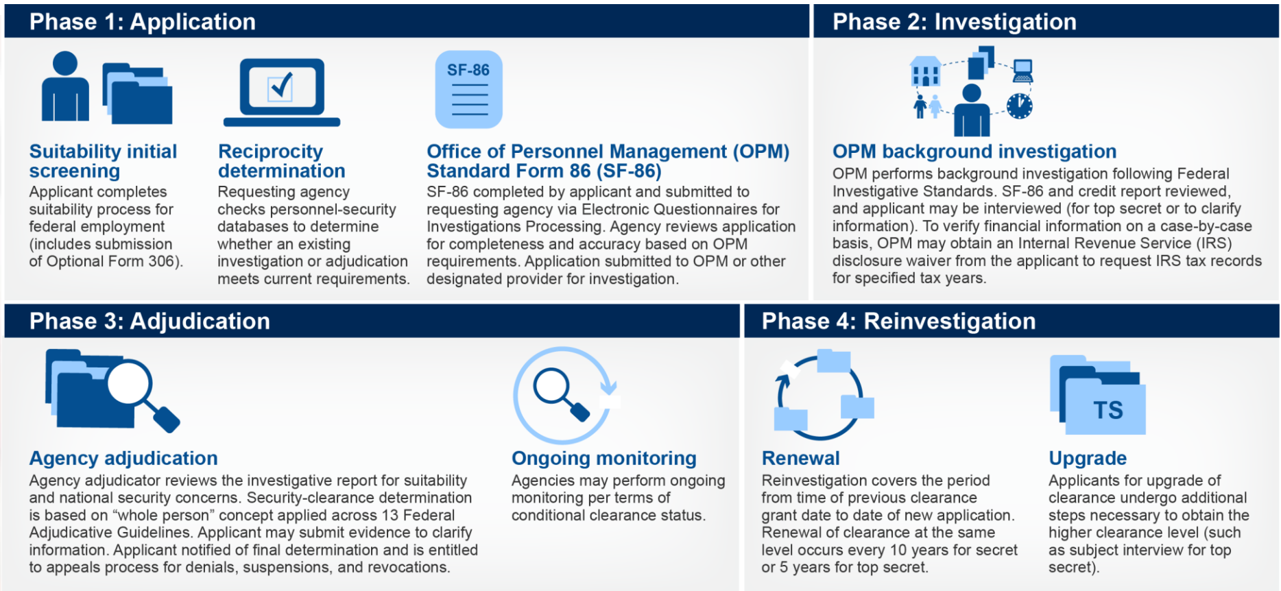
Figure 1: Security Clearance Process

As shown in figure 1, to ensure the trustworthiness and reliability of personnel in positions with access to classified information, government agencies rely on a personnel security clearance process that includes multiple phases: the initial application, investigation, adjudication, and reinvestigation (where applicable, for renewal or upgrade of an existing clearance).