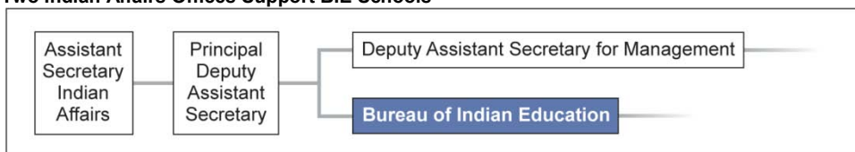
Two Indian Affairs Offices Support BIE Schools