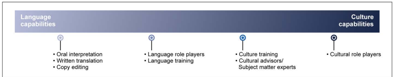
Figure 1: Types of Contract Support to Enhance DOD Foreign Language and Culture Capabilities

types of foreign language support that DOD has acquired through contracts to enhance language and culture capabilities of its military forces.