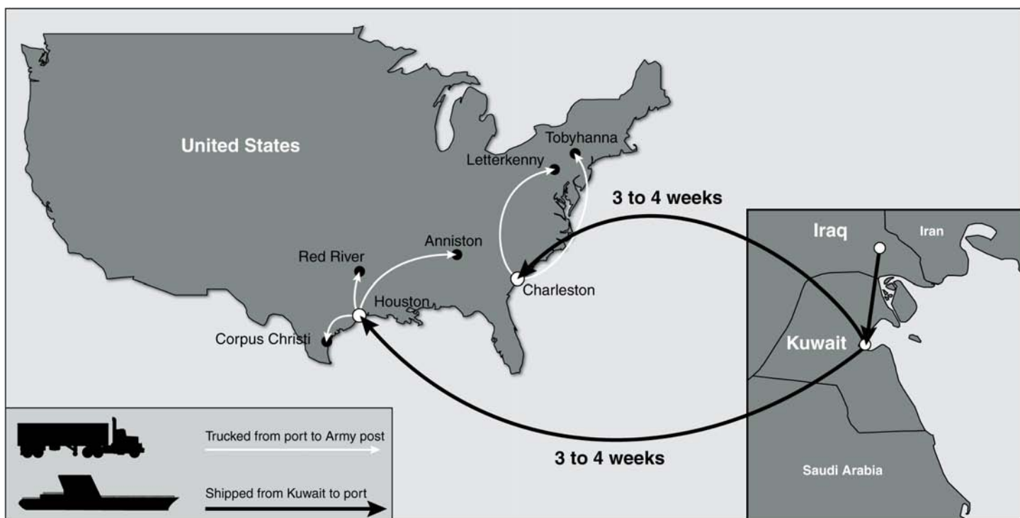
Figure 2: Retrograde of Equipment Leaving Southwest Asia and Returning to the United States for Reset

to address equipping requirements. Army officials said that the Reset Task Force inspects non-ARI equipment to determine the level of reset it will require. Once the inspection is complete, the equipment is shipped back to the U.S. with disposition instructions for reset or for automatic reset induction. Figure 2 illustrates the retrograde process for equipment leaving Southwest Asia and returning to the United States for reset repairs.