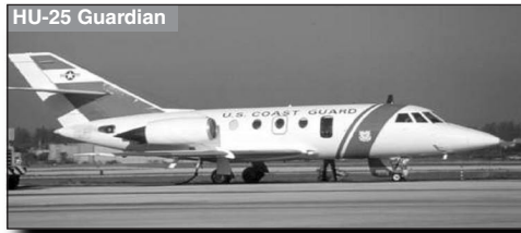
Figure 2: Selected DHS Aviation Assets