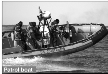
Figure 3: Selected DHS Marine Assets