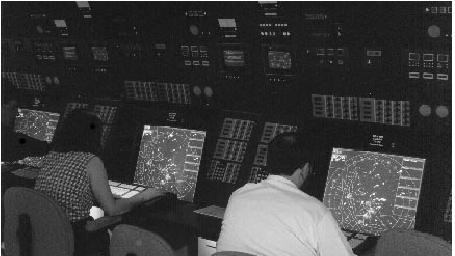
Figure 1: STARS Workstation