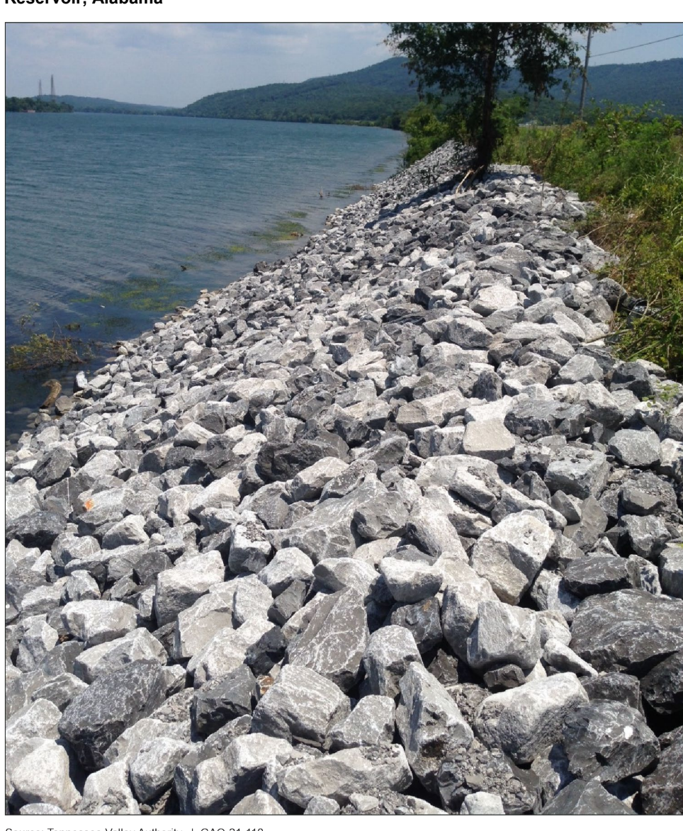
Figure 3: Tennessee Valley Authority Shore Stabilization Project, Guntersville Reservoir, Alabama

Source: Tennessee Valley Authority. | GAO-21-110