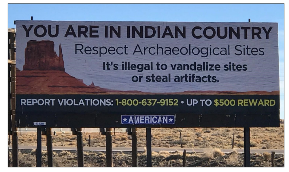
Figure 2: Bureau of Indian Affairs Billboard in Arizona Providing Information for how to Report Theft or Damage at Archeological Sites

GAO-21-110