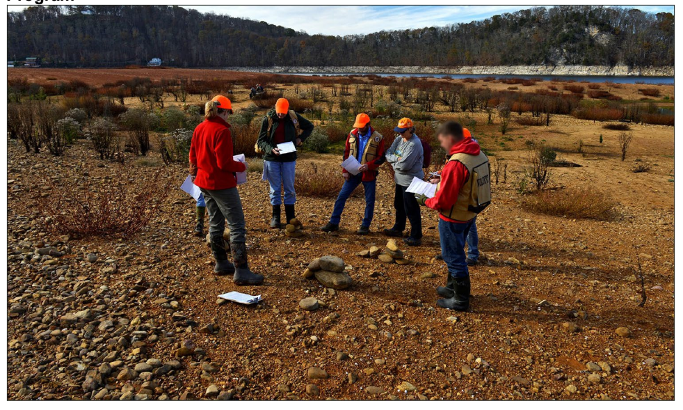
Figure 4: Volunteers Participating in the Thousand Eyes Volunteer Site Stewardship Program

Source: Tennessee Valley Authority. | GAO-21-110