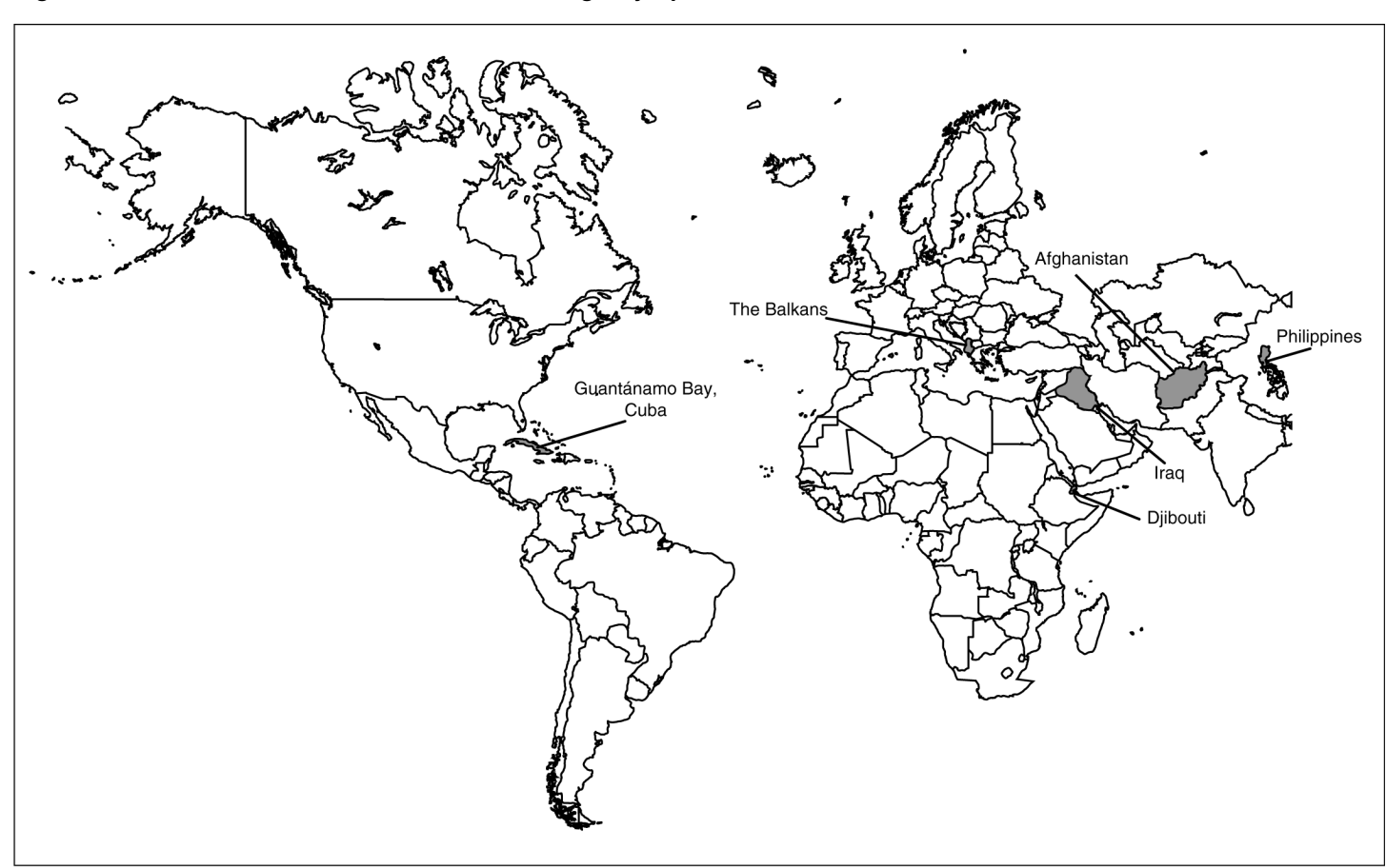
Figure 1: Location of DOD's Fiscal Year 2003 Contingency Operations