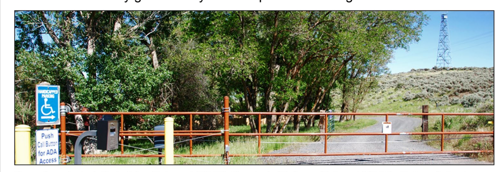
Security gate installed at the Fish and Wildlife Service's Malheur National Wildlife Refuge following an armed occupation in January 2016.

The four federal land management agencies have completed some but not all of the facility security assessments on their occupied federal facilities as required by the Interagency Security Committee (ISC). Officials at the four agencies said that either they do not have the resources, expertise, or training to conduct assessments agency-wide. FWS has a plan to complete its assessments, but BLM, the Forest Service, and the Park Service do not. Such a plan could help these agencies address the factors that have affected their ability to complete assessments. The ISC also requires that agencies conduct assessments using a methodology that meets, among other things, two key requirements: (1) consider all of the undesirable events (e.g., arson and vandalism) identified as possible risks to facilities, and (2) assess the threat, vulnerability, and consequence for each of these events. The Forest Service's methodology meets these two requirements and the Park Service's methodology partially meets the requirements, but BLM and FWS have not yet established methodologies for conducting facility security assessments. Without developing a plan for conducting all of the remaining facility security assessments and using a methodology that complies with ISC requirements, agencies may not identify the risks their facilities face or identify the countermeasures—such as security cameras or security gates—they could implement to mitigate those risks.