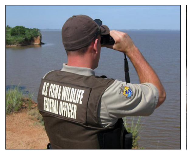
Figure 5: Examples of Fish and Wildlife Service and National Park Service Employee Uniforms

Agency employees work with the public and are often easily recognizable. Agency officials said their employees are required to interact with the public as part of their official duties, which can put them at risk of being threatened or assaulted. FWS officials said they temporarily closed field units in an adjacent state during the beginning of the armed occupation of the Malheur National Wildlife Refuge to reduce the likelihood that their employees would interact with members of the public who were traveling to Malheur to participate in the occupation. FWS and Park Service officials stated that their employees are easily recognizable because they typically wear uniforms, which may put them at greater risk of being harassed or threatened by individuals who hold anti-government beliefs. (See figure 5 for examples of uniforms.) In response, on certain occasions, some agency officials direct their employees to wear street clothes instead of their uniforms. Officials we interviewed indicated that whenever they are concerned about a potential safety issue at their field unit, such as a protest, they may encourage eligible employees to telework from home instead of reporting to their work station.