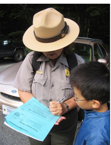
Sources: U.S. Fish and Wildlife Service (left photo); National Park Service (right photo). | GAO-19-643