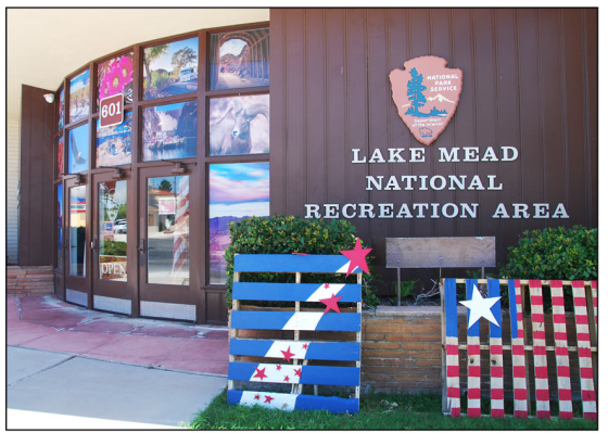
One-way vinyl window film with nature photographs provides security for the front desk attendant at a National Park Service field unit.