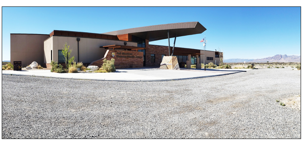
Figure 6: Example of a Remote Fish and Wildlife Service Field Unit

• Employees often work in remote locations to fulfill agency missions. Agency officials stated that it can be difficult to protect employees because, as part of their field work, employees may be dispersed across hundreds of miles of federal lands and may be located hours or days away from the nearest agency law enforcement officer. (See figure 6 for an example of a remote location.) As a result, some agency officials said they sometimes direct employees to postpone fieldwork if there is a known or anticipated risk of threats or assaults. In addition, according to officials, various field units have developed check-in and check-out procedures to keep track of employees when they are in the field and to help verify that they report back to the office after concluding their fieldwork. Additionally, some field units have purchased satellite communication devices that operate when cell or radio signals are not available, so that employees conducting remote field work can call for help if needed.