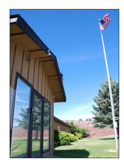
Blast-resistant film reflects the exterior landscape at a Bureau of Land Management field unit.