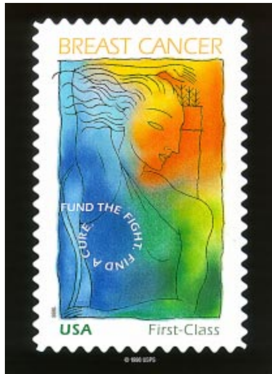
Figure 1: Reproduction of the 1998 Breast Cancer Research Semipostal