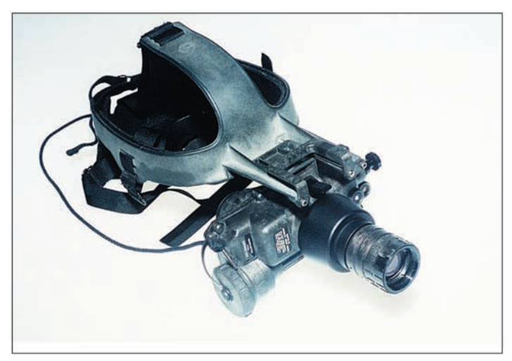
Figure 3: Examples of Man-Portable NVDs