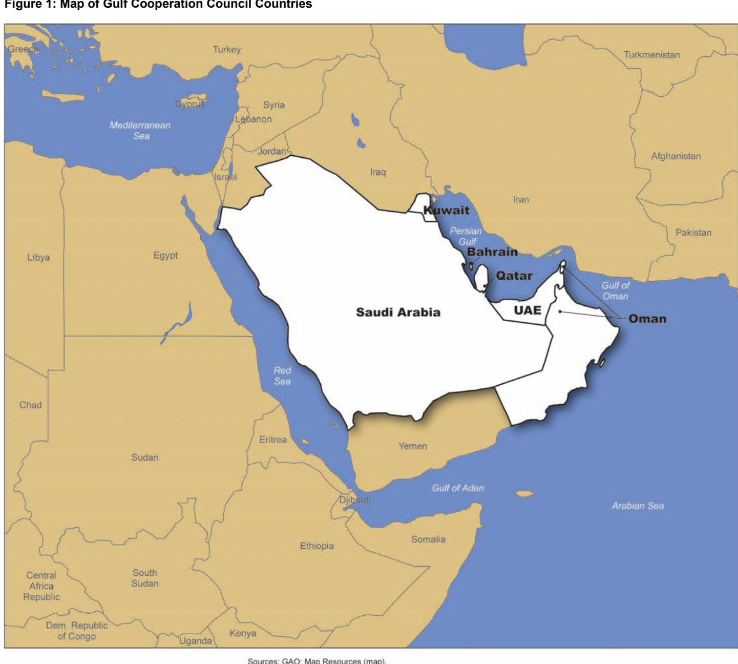
Figure 1: Map of Gulf Cooperation Council Countries