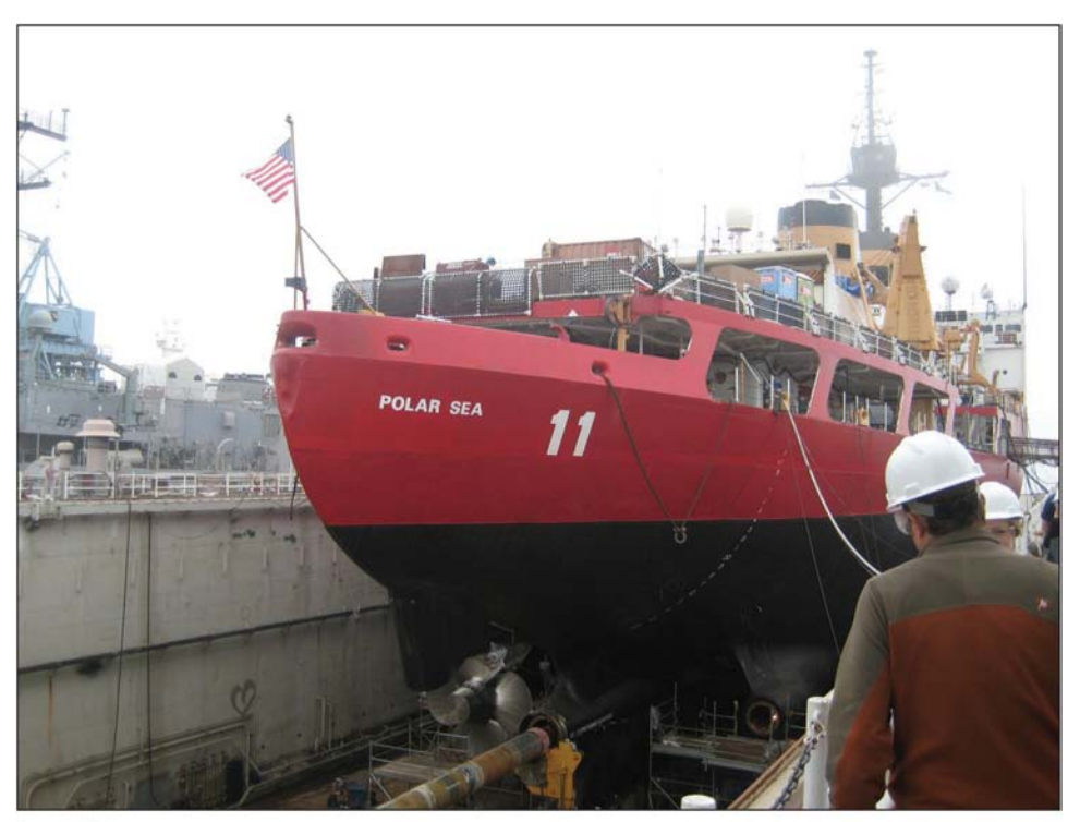
Figure 2: Polar Sea in Dry Dock

• Healy (operative): The Healy is a medium icebreaker, commissioned in 2000, with an expected 30-year lifespan. The Healy is less capable than the heavy icebreakers and is primarily used for scientific missions in the Arctic. As a medium icebreaker, the Healy does not have the same icebreaking capabilities as the Polar Sea and Polar Star . Because of this, it cannot operate independently in the ice conditions in the Antarctic or ensure timely access to some Arctic areas in the winter.