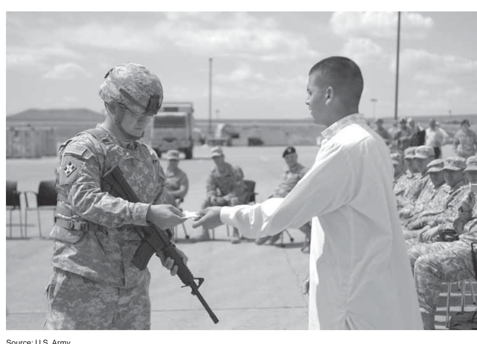
Figure 2: Soldiers Participating in Training at Fort Carson Language Training Site