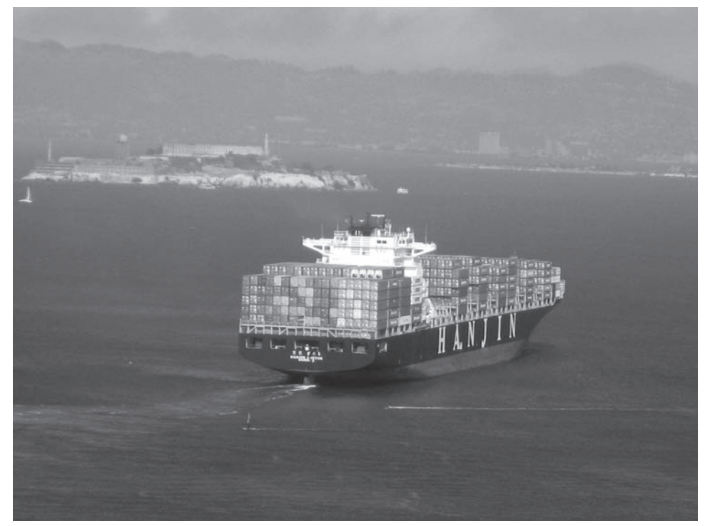
Figure 4: The Vessel Stow Plan Allows CBP to Identify the Location of Unmanifested Containers on a Vessel While in Transit, Prior to It Reaching a U.S. Port