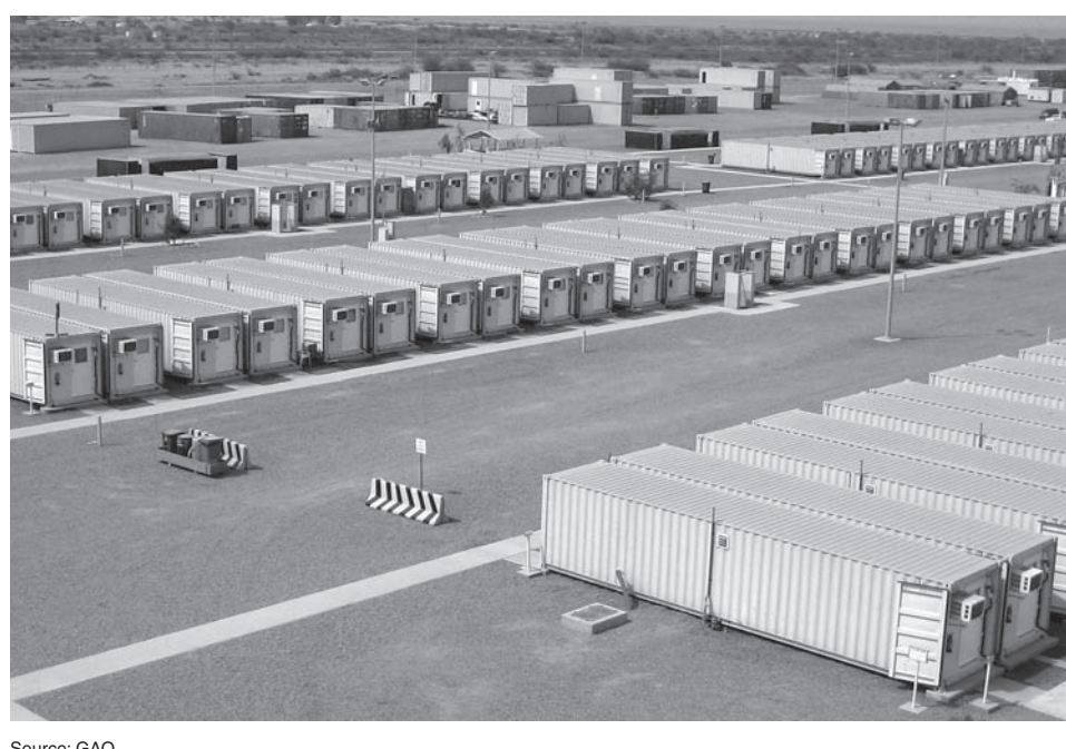
Figure 4: Housing at Camp Lemonnier, Djibouti (2008)