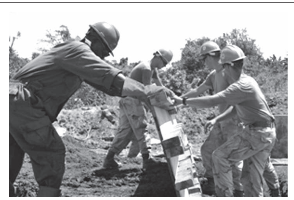
CJTF-HOA and Uganda People's Defense Force work to construct a bridge foundation