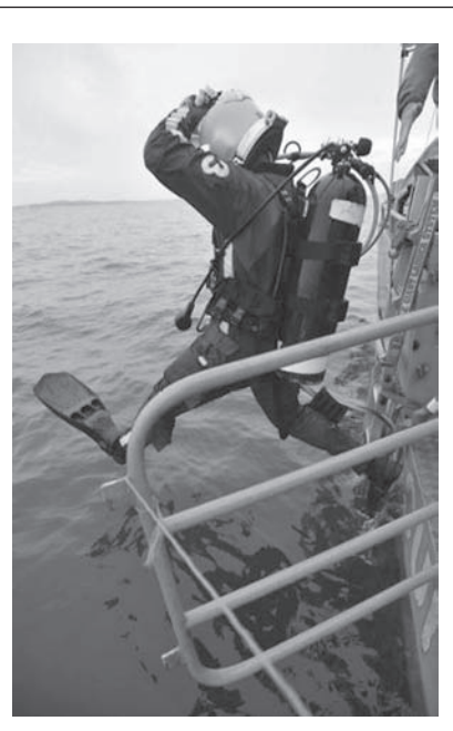
A search and recovery operation in Africa's Lake Victoria