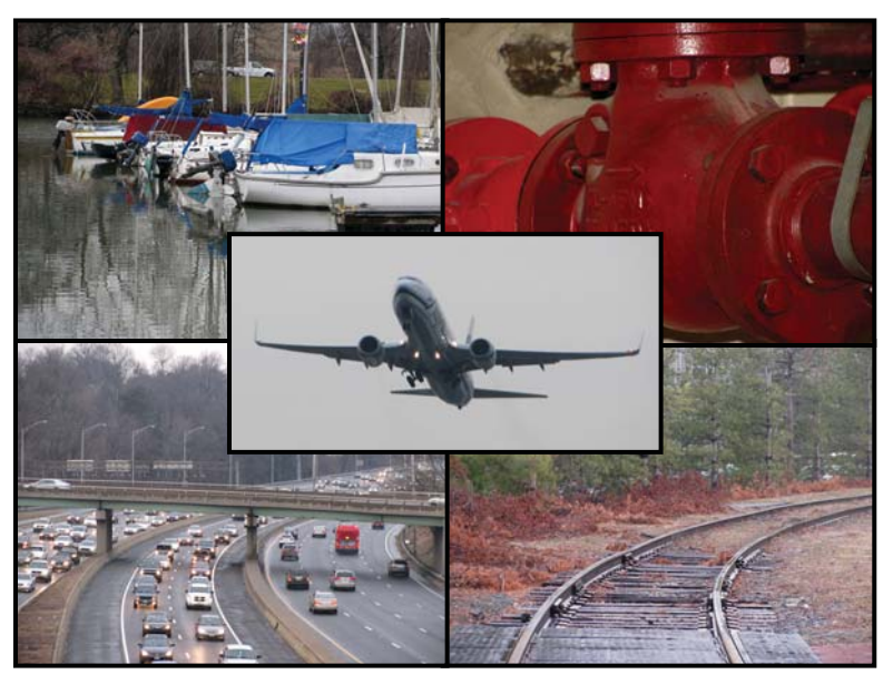
Figure 7. NTSB Investigative Modes: Aviation, Marine, Pipeline, Railroad, and Highway