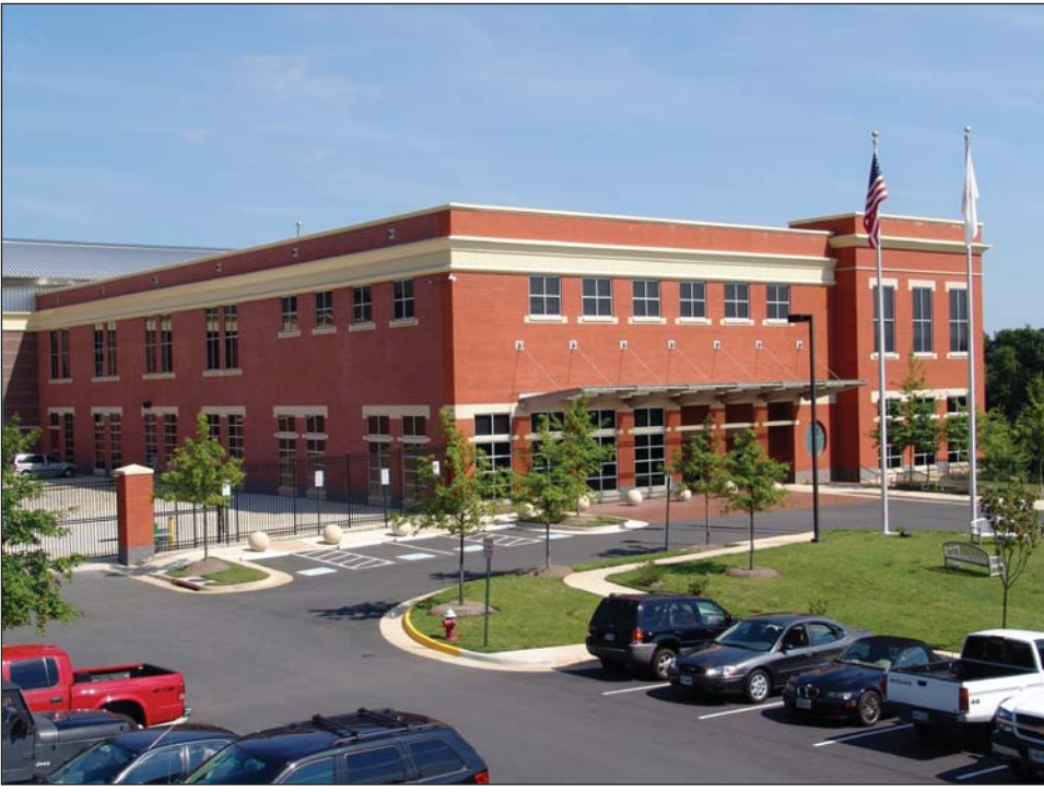
Figure 6: NTSB Training Center