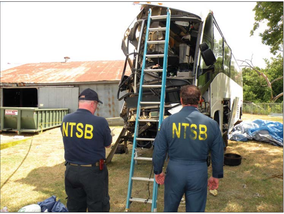
Figure 4: Two NTSB Investigators Assess Motorcoach Wreckage