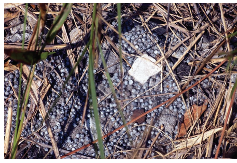
Figure 3: Lead Shot on School Playground at Tyndall Air Force Base in June 2009