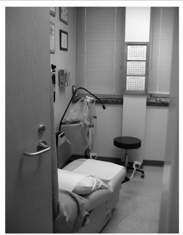
Figure 1: Correct and Incorrect Placement of Exam Tables in Gynecological Exam Rooms at Department of Veterans Affairs (VA) Medical Facilities