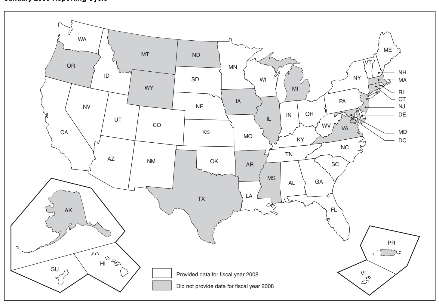
Figure 5: Army National Guard States and Territories Reporting Recruiter Irregularity Data for Fiscal Year 2008 during the January 2009 Reporting Cycle