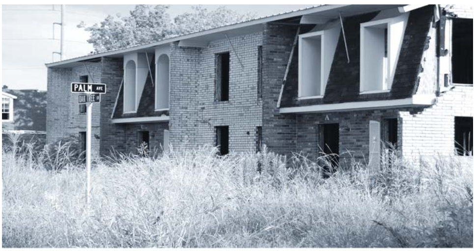
Figure 3: Replacement Street Signs Facilitated Address Canvassing in New Orleans