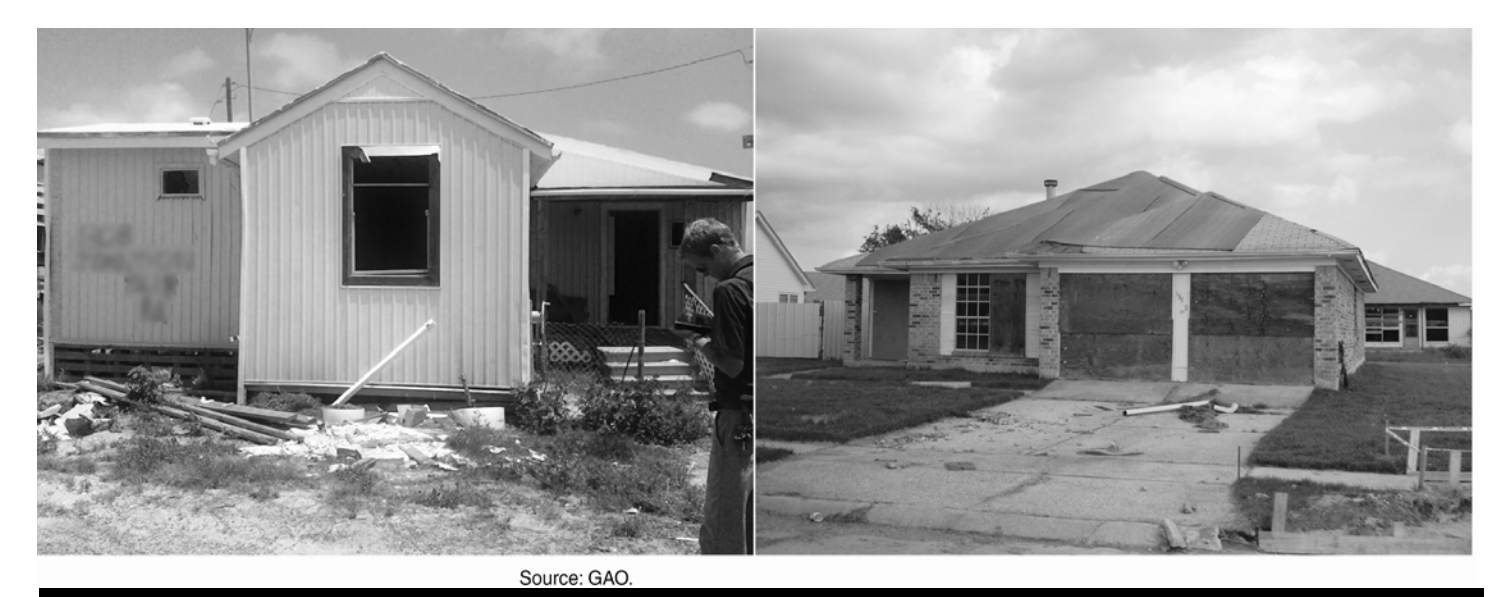
Figure 2: Locating and Counting People Displaced by Storms Presents a Challenge

Additional steps taken by the city of New Orleans also helped the Bureau overcome the challenge of canvassing neighborhoods devastated by Hurricane Katrina. As depicted in figure 3 below, city officials replaced the street signs even in abandoned neighborhoods. This assisted listers in locating the blocks they were assigned to canvass and expedited the canvassing process in these deserted blocks.