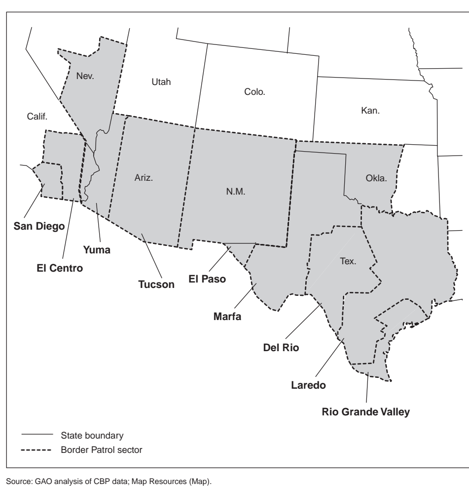
Figure 1: Map of Border Patrol Sectors along the Southwest Border

SBInet is the program for acquiring, developing, integrating, and deploying an appropriate mix of surveillance technologies and command, control, communications, and intelligence (C3I) technologies. SBInet surveillance technologies are to include sensors, cameras, and radars. Additional technologies, such as aerial assets (e.g., helicopters and unmanned aerial surveillance aircraft) and Mobile Surveillance Systems (MSS) may be added in the future, but as of August 2009, whether and to what extent the additional technologies would be included in the configuration of the long-