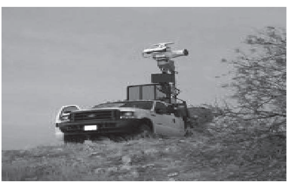
Figure 5: Example of an MSS Unit

the operators indicated that on windy days the Block 1 radar had issues that resulted in an excessive number of false detections and that the capability was not adequate for optimal operational effectiveness. The operators also compared the Project 28, MSS, and Block 1 cameras and indicated that the features of the Block 1 camera were insufficient in comparison to features of the Project 28 and MSS cameras. Overall, the feedback from operators indicated "the need for a number of relatively small, but critical enhancements" to the COP and overall concerns about inconsistent system performance.