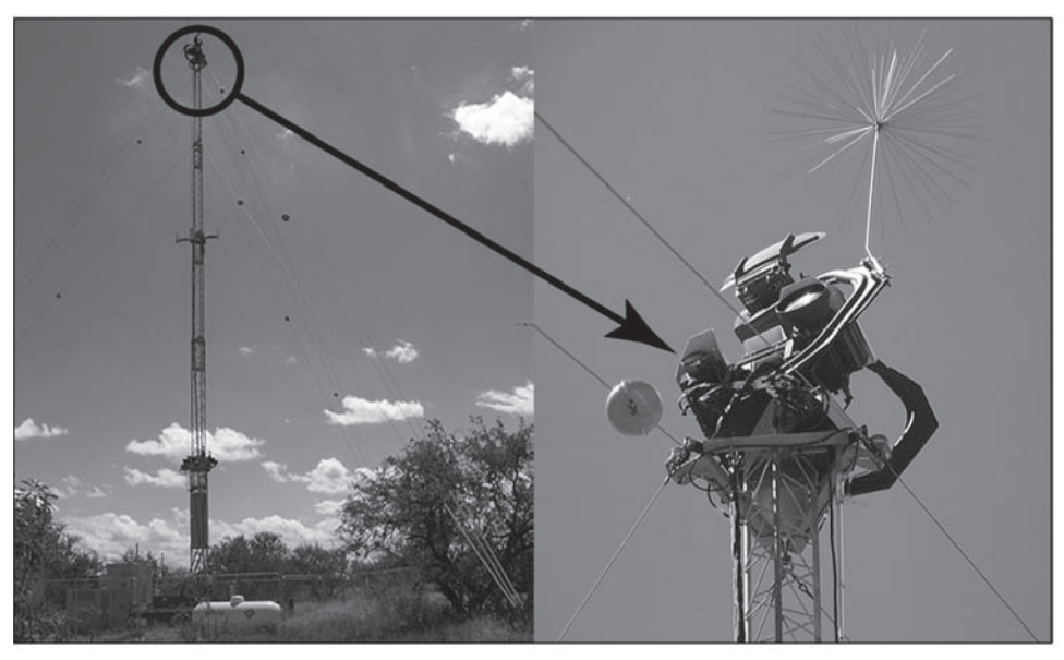
Figure 2: Project 28 Mobile Sensor Tower Deployed in the Tucson Sector

The first SBInet deployment task order was for an effort known as Project 28. The scope of Project 28, as described in an October 2006 task order to Boeing, was to provide a system with the capabilities required to control 28 miles of border in Arizona. Project 28 was accepted by the government for deployment in February 2008—8 months behind schedule. This delay occurred because the contractor-delivered system did not perform as intended. For example, Boeing was unable to integrate components, such as towers, cameras, and radars with the COP software. Project 28 is currently operating along 28 miles of the southwest border in the Tucson sector of Arizona (see fig. 2).