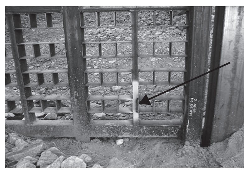
Figure 6: Examples of Repaired Breaches in Newer Fencing