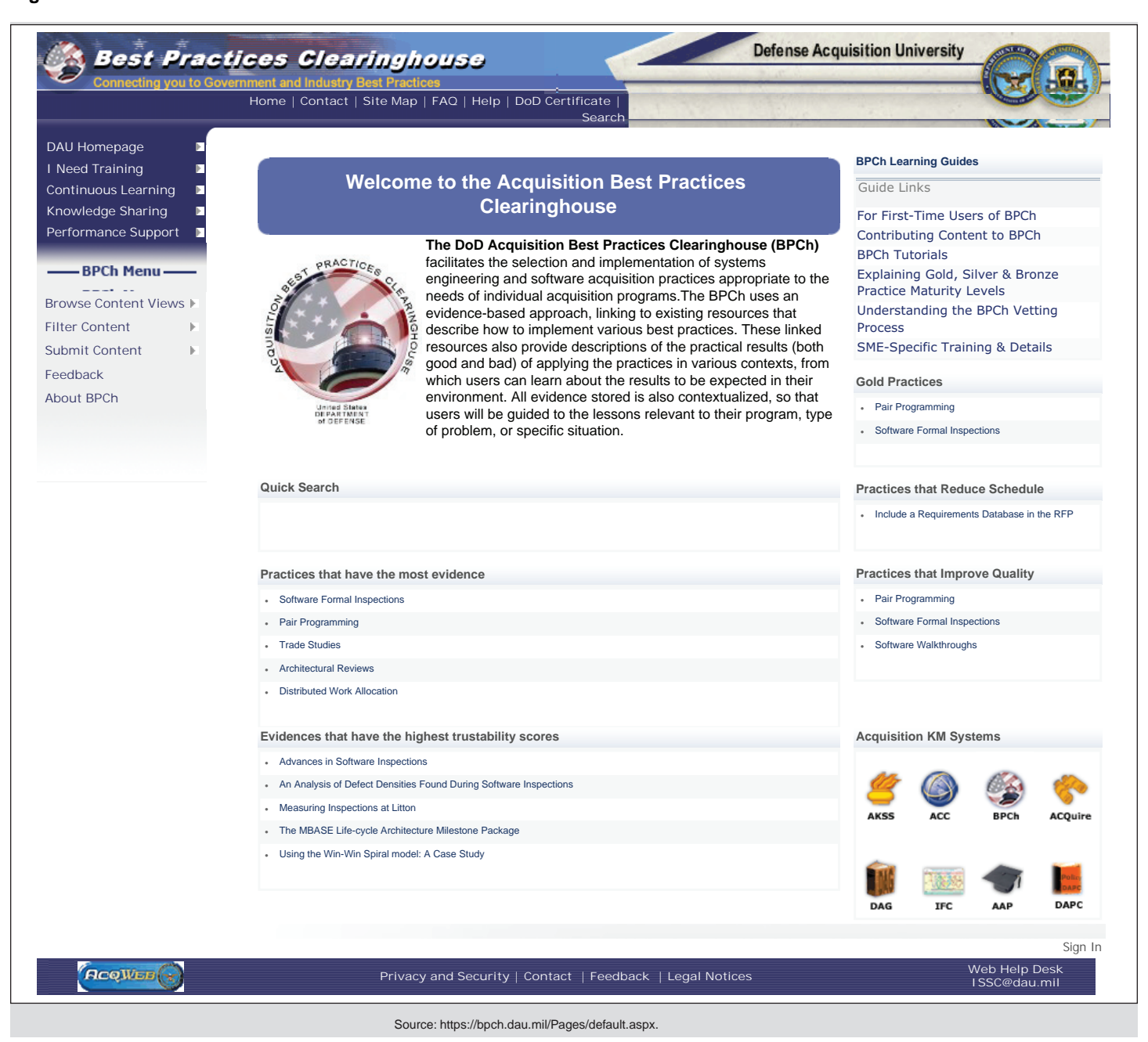
Figure 1: View of DOD Web-based Portal