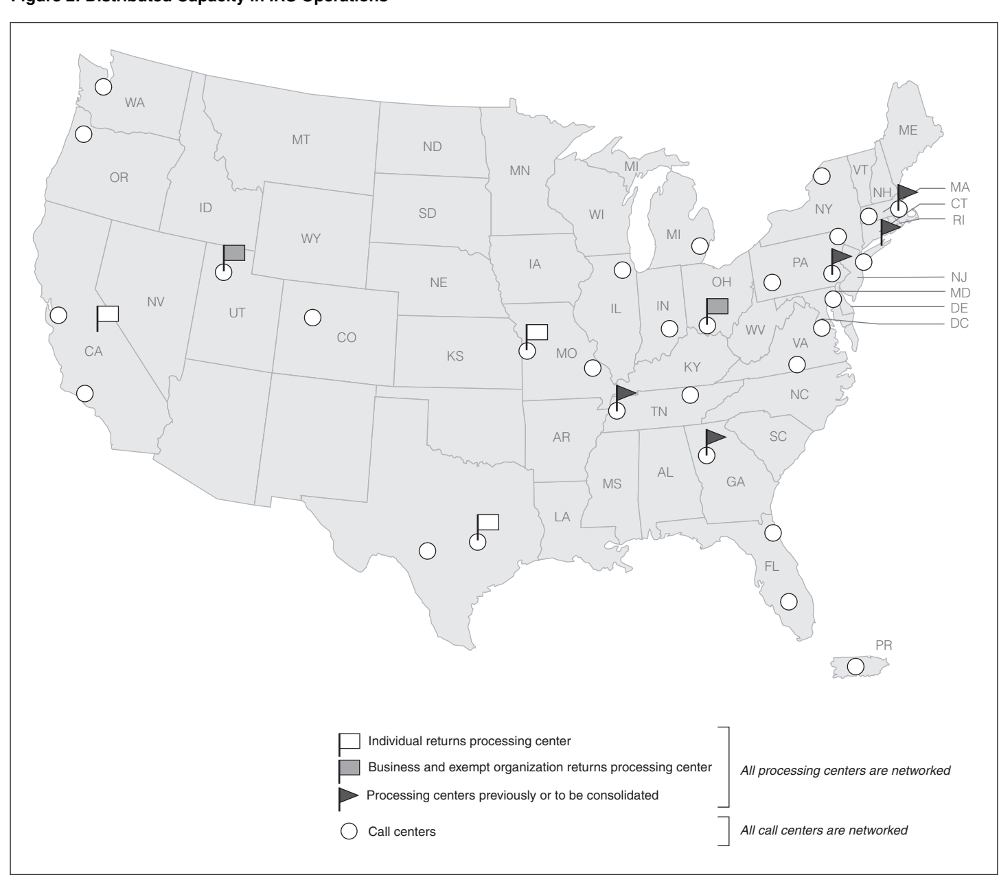
Figure 2: Distributed Capacity in IRS Operations