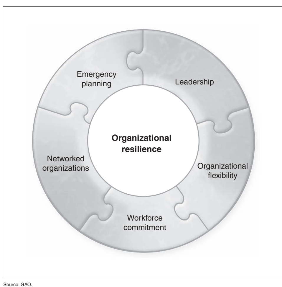
Figure 1: Framework of Organizational Resilience