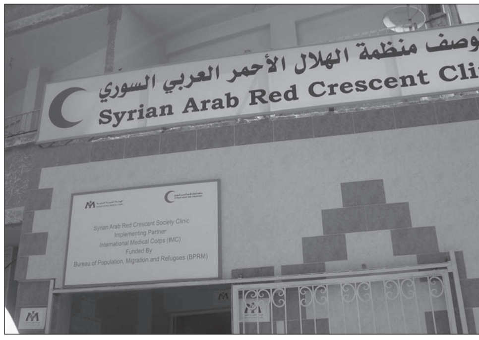
Figure 4: PRM-Funded Clinic in Syria

In Syria, we visited another PRM-funded project that provided medical assistance to Iraqi refugees and vulnerable host country populations (see fig. 4). According to the program manager, the clinic provided primary health care, child health screening, chronic noncommunicable disease care, maternal health care, and health education. We toured the pharmacy, the dental unit, and the laboratory where basic tests are performed.