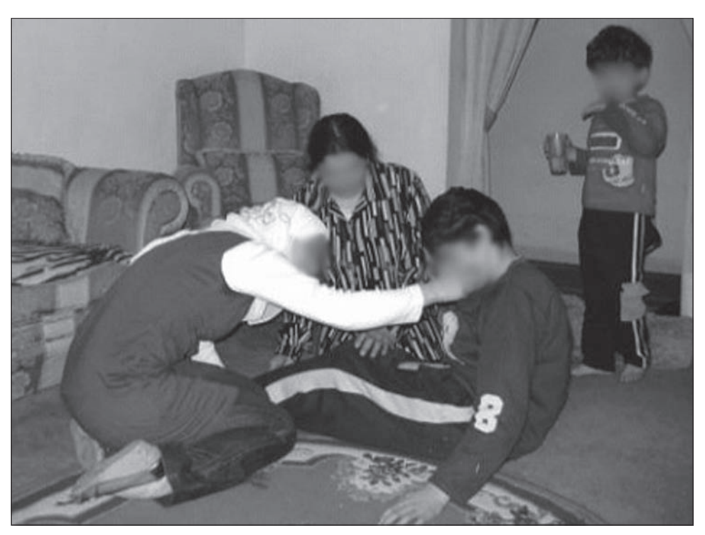
Figure 3: Outreach Volunteer Conducting a Home Visit in Jordan

In terms of health care, we visited a clinic in Jordan, funded through the State Department's PRM bureau, which assisted Iraqi refugees, and met with outreach workers. According to the program manager, the project provided health care to Iraqis and stipends for some Iraqi women conducting community outreach. (See fig. 3, showing an Iraqi volunteer conducting outreach.)