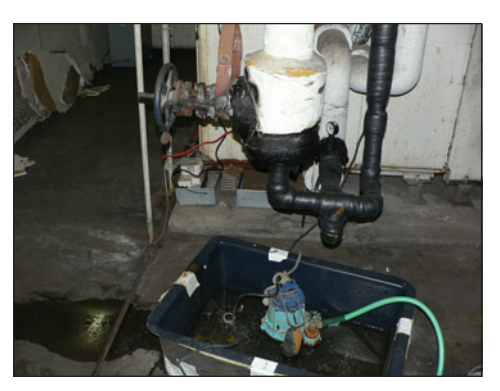
Figure 2: Leaking Pipes and Cracked Walls at a Damaged Warehouse Facility at Fort Sam Houston

At the eight installations we visited, facility sustainment requirements were not fully funded every year during fiscal years 2005, 2006, and 2007. At some, but not all, of the installations, local officials stated that sustainment funding had not been available to accomplish all needed work and, as a result, many installation facilities were in a deteriorated condition. For example, officials at Fort Sam Houston stated that the foundation of a warehouse facility had shifted, which caused cracks in the walls, warped door frames, and leaking pipes (see fig. 2). Repairs had not been completed because adequate sustainment funds were unavailable. Fort Sam Houston officials also noted that several barracks buildings, which were still in use, had deteriorated because of inadequate funding. For example, porch surfaces were crumbling, paint was peeling, and windows needed repair (see fig. 3).