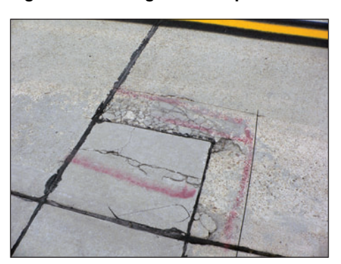
Figure 7: Cracking Aircraft Aprons at Randolph Air Force Base