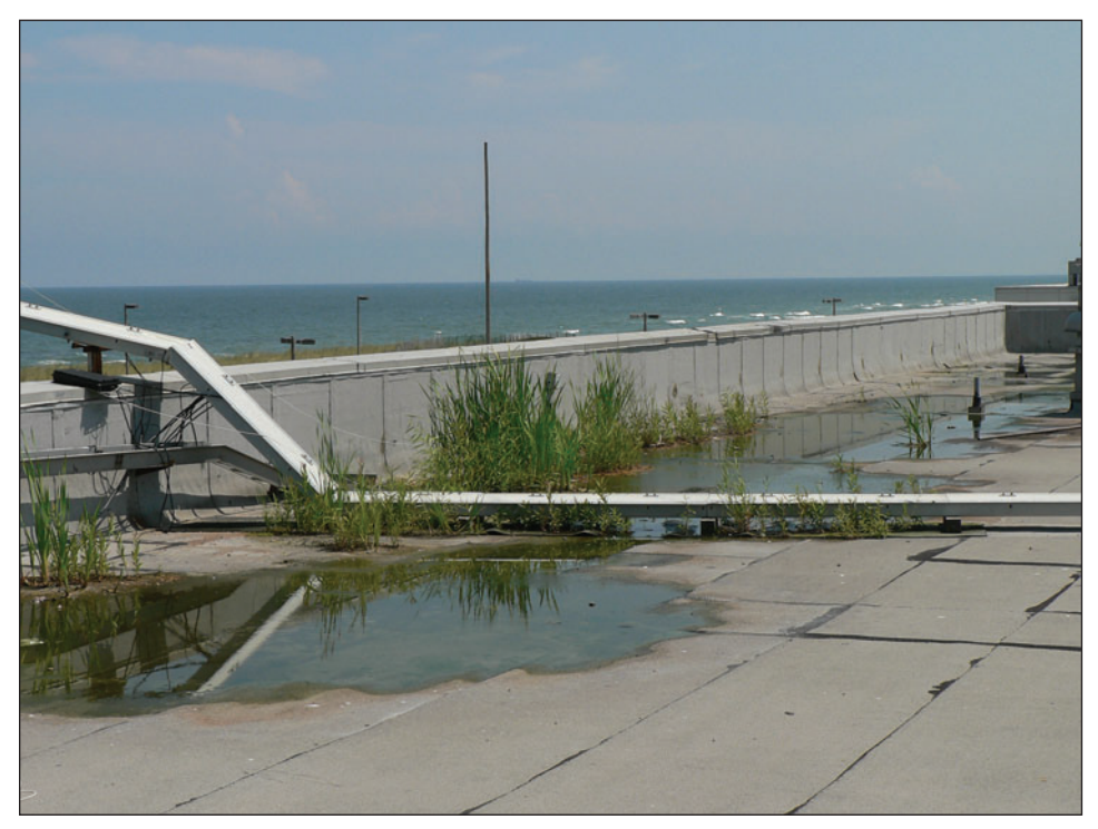
Figure 4: Standing Water on a Leaking Roof of a Weapons and Radar Training Building at an Oceana Naval Air Station Annex