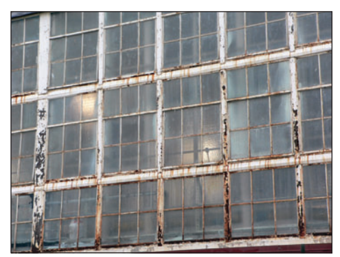
Figure 6: Leaking Windows and Electrical Panels that Created a Safety Hazard at a Deteriorated Aircraft Maintenance Hangar on Randolph Air Force Base