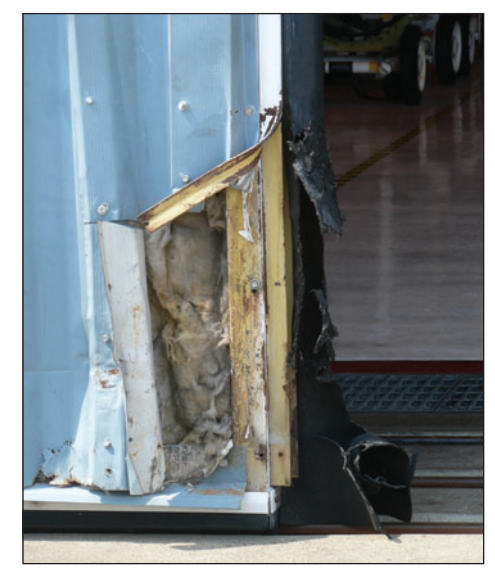
Figure 5: Damaged Aircraft Hangar Doors at Oceana Naval Air Station