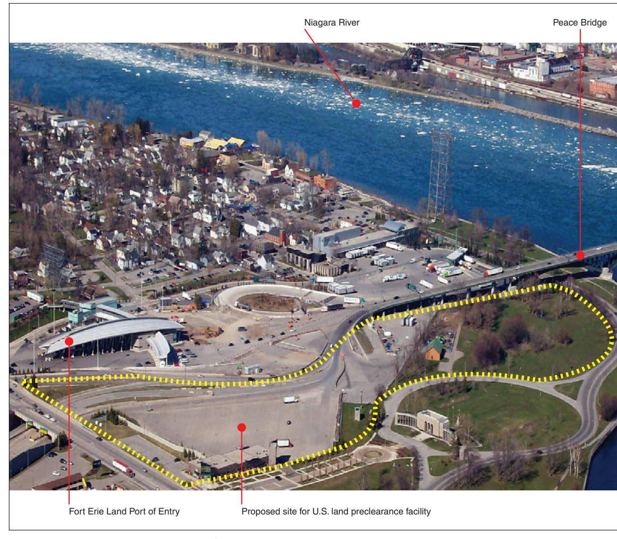
Figure 3: View of Fort Erie, Ontario, Canada Land Port of Entry