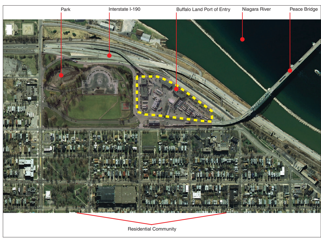
Figure 1: Overhead View of Buffalo Land Port of Entry