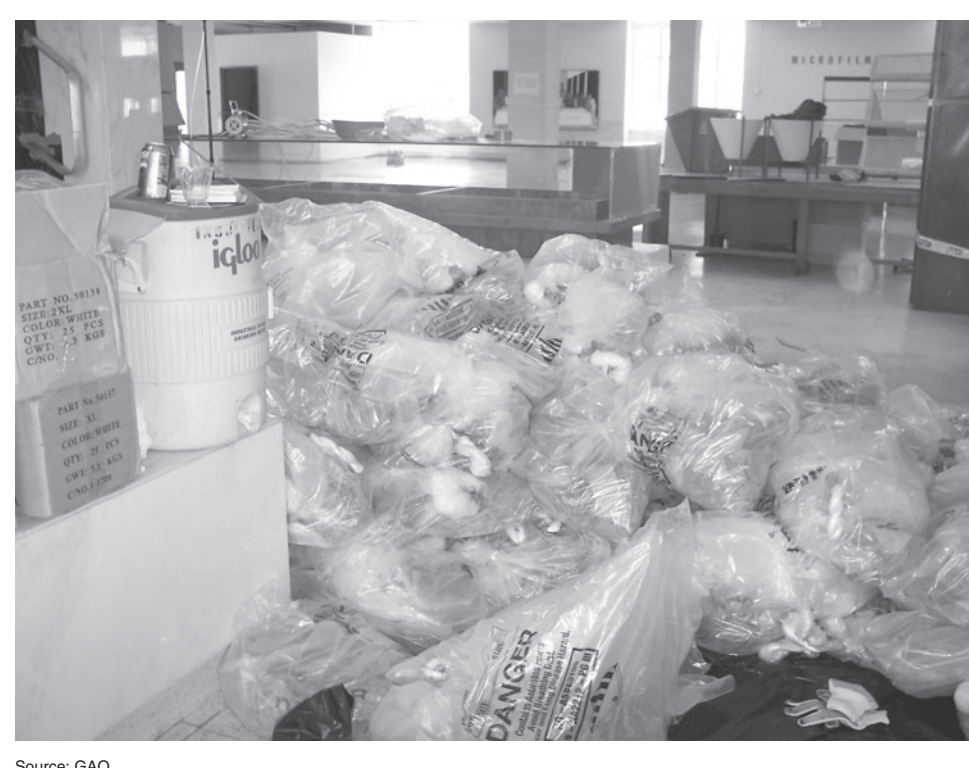
Figure 4: Removed Asbestos from Dillard University Library Awaiting Disposal