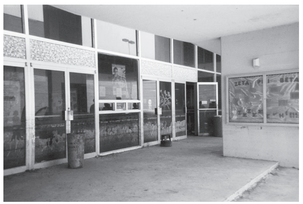
Figure 3: Exterior of Southern University's Library with Waterline Indicating the Extent of Flooding