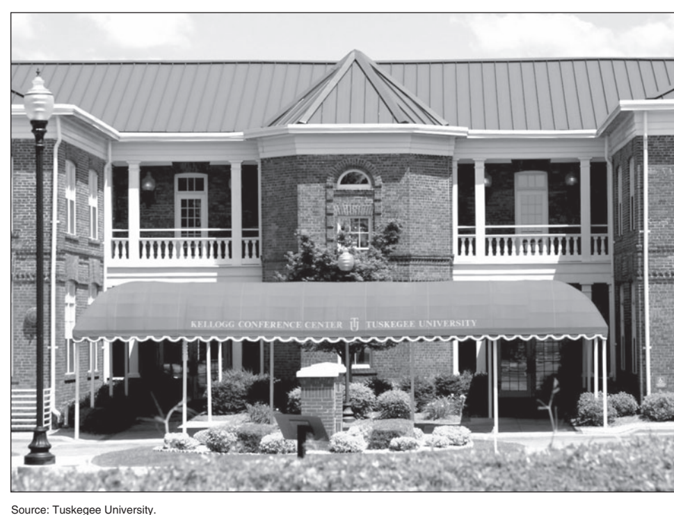
Figure 1: The Renovated Kellogg Conference Center at Tuskegee University

Note: The University relied in part on the HBCU Capital Financing Program to renovate and expand this facility. In particular, a program loan was used to finance the upgrades of the heating and ventilation system.