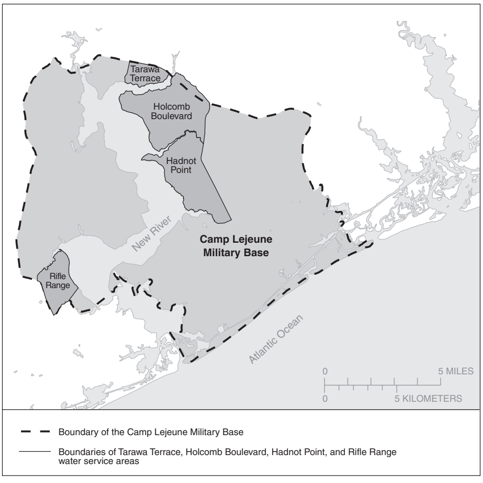
Figure 2: Selected Water Service Areas at Camp Lejeune Serving Base Housing from the 1970s through 1987

treatment plant was shut down and the Holcomb Boulevard water distribution system was expanded to include the Tarawa Terrace water service area.