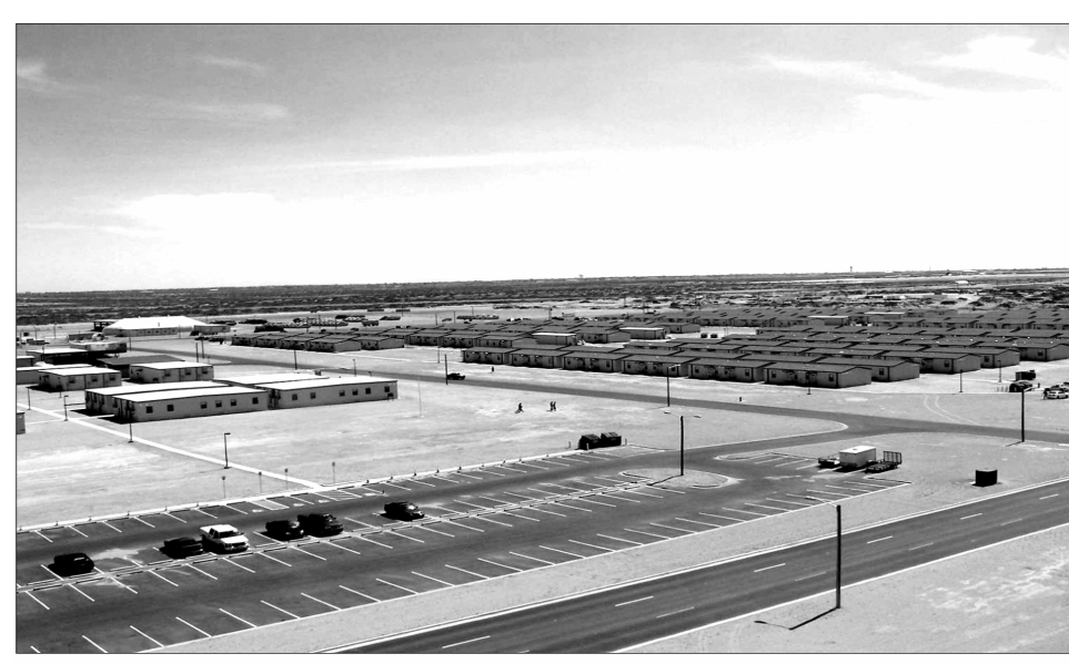
Figure 2: Panoramic View of Relocatable Buildings at Fort Bliss, Texas