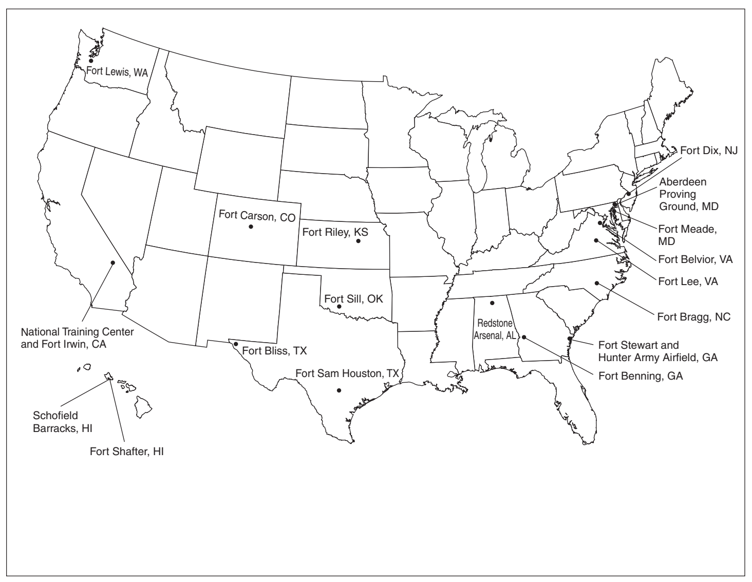
Figure 1: Locations of 18 Army Installations Expecting Net Gains of at Least 2,000 Personnel for Fiscal Years 2006 through 2011 Because of BRAC, Overseas Rebasing, Modularity, and Other Miscellaneous Restationing Actions