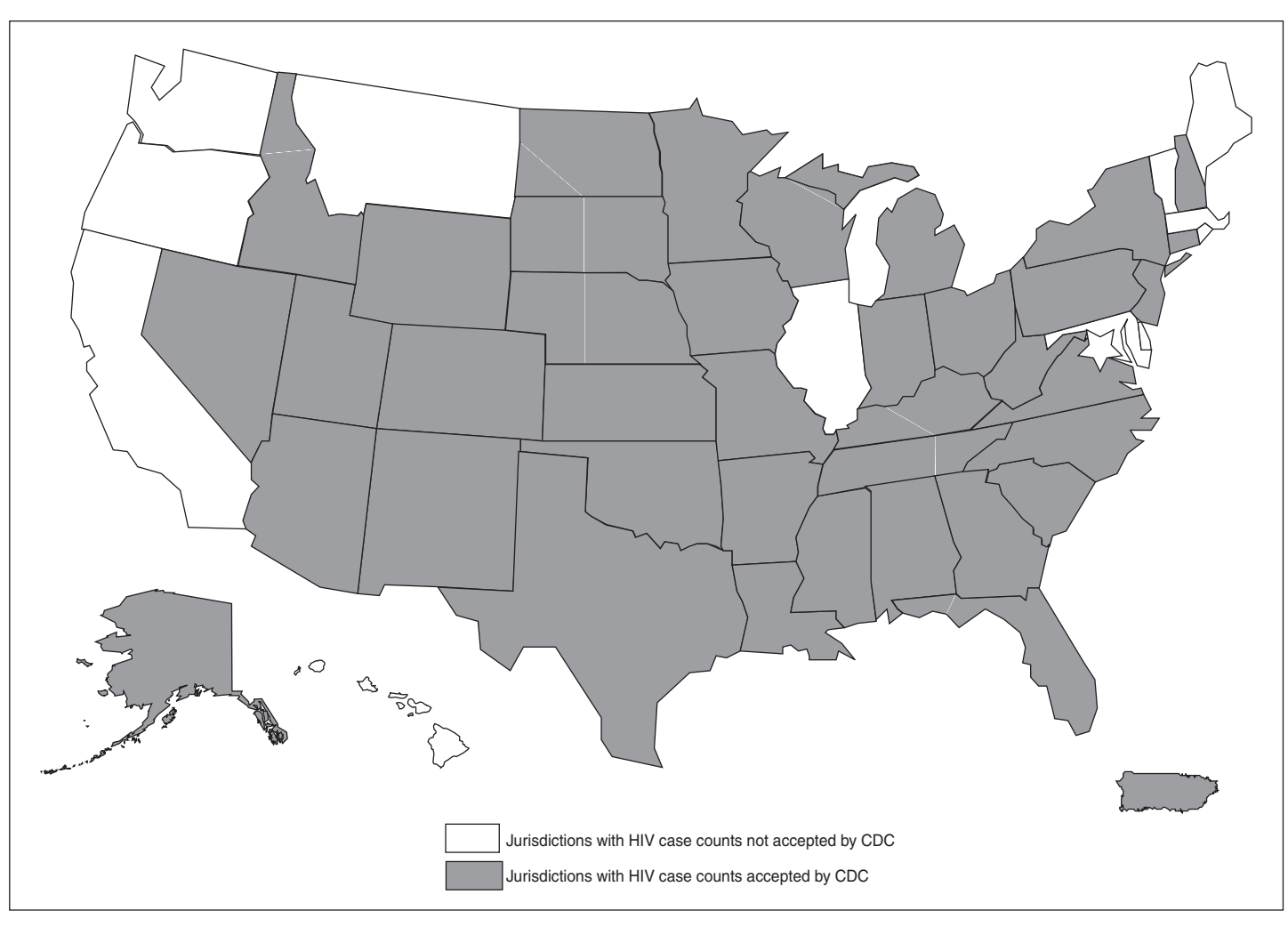
Figure 2: CDC Acceptance of HIV Case Counts, December 2005