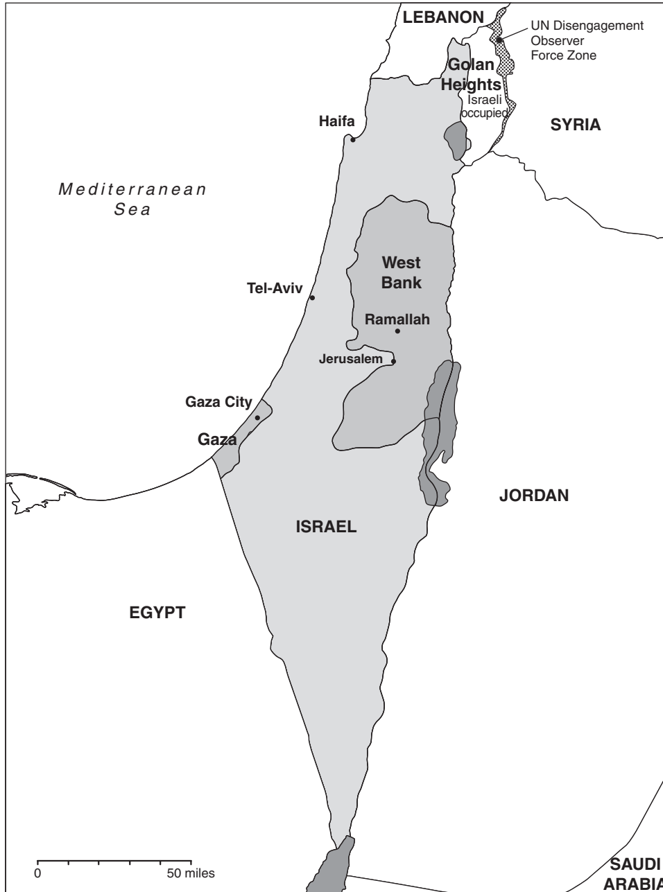
Figure 1: Map of West Bank and Gaza and Surrounding Countries